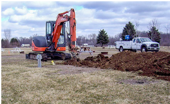
Working on our electric upgrade

Work on the electric has gone well and will be completed by the time the park opens on April 15.