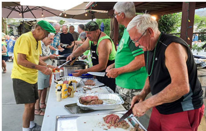
Corned beef and cabbage for everyone!

along with their favorite beverage. Over time the group grew to include upwards of 20 folks and sometimes even more. Definitely something we see getting more popular with time.