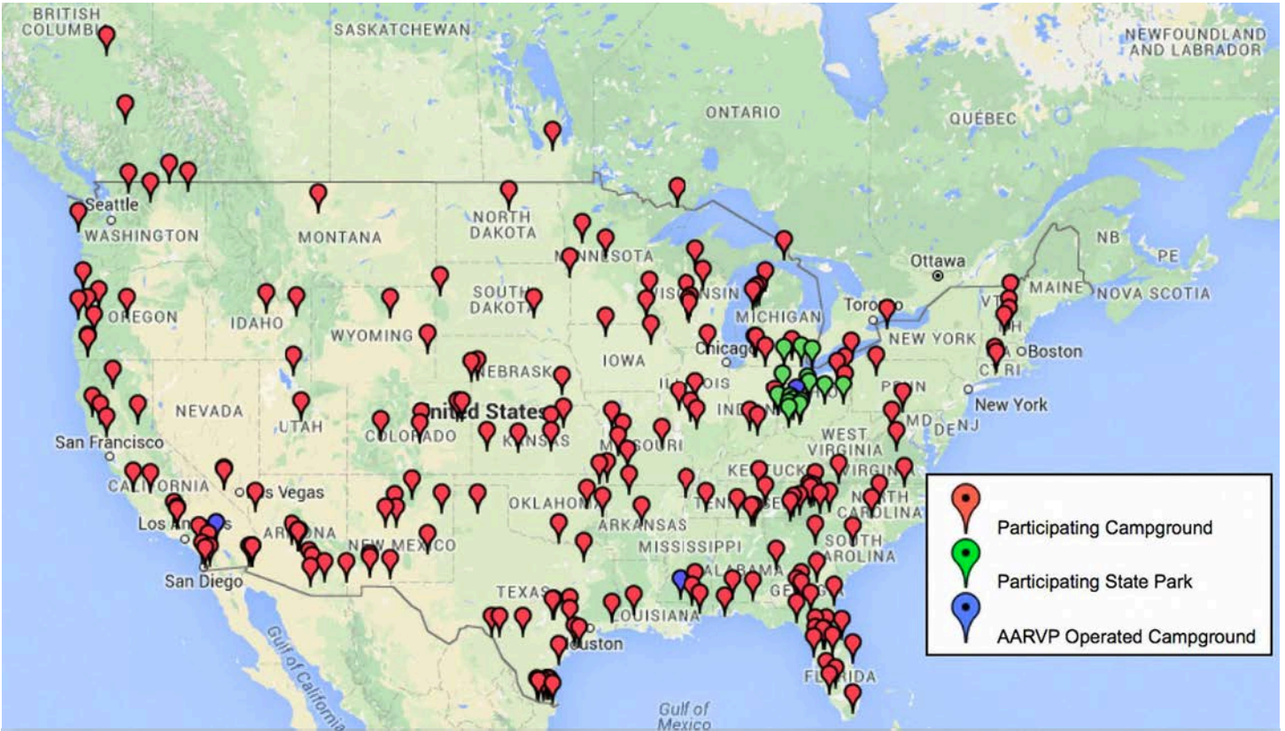
Tomorrow's Stars, continued from page 1

A complete listing, including the latest updates, is available online at www.AARVClub.com