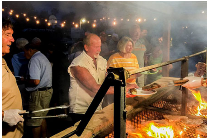
90 perfectly steaks, grilled to order

A very popular new event was created by a small group of our members and guests that steadily grew into a great way to end every day. Each evening at 5:00 pm the group gathered in the BBQ area for Happy Hour, each bringing a tasty snack to share