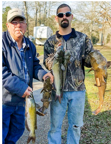
The catfish are biting!

occupancy to 60% and then less and less as the warmer weather approaches.