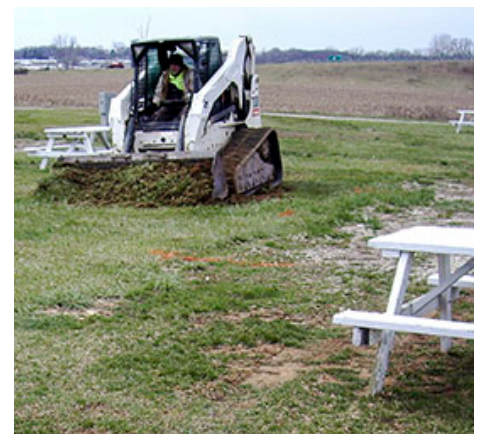
Building new pads

and crawfish boils are common. The first big holiday weekend of the camping season is right around the corner so clean out the