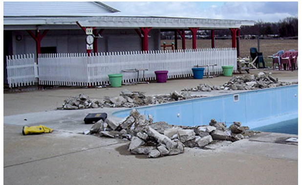
Making repairs to the pool