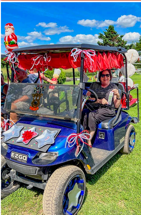
3rd Place decorated cart

One thing we really want to stress to all of you who are entering and exiting the park this year is our speed limit of 5 mph. As a family park, we love watching all the children ride their bikes and run around the park. We all know from when we were kids, sometimes paying attention just wasn't a priority and this is when accidents happen. That's where we rely upon you following the speed limit, which allows you to be able to stop on quick notice and help us keep them safe.