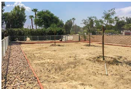
The Dog Park is ready for grass

What began in 2012 with all new 3 phase service coming in from the street and revamping 33 sites to full 50 amp service will soon