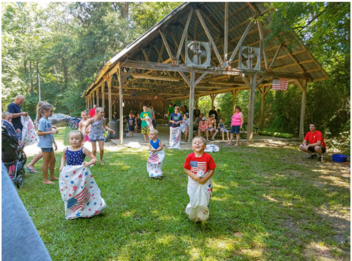
Fourth of July sack race