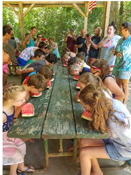
Watermelon eating contest

Young and old had a blast participating in bingo, cake walks, limbo, watermelon eating contest, egg toss, sack races, bicycle, hula