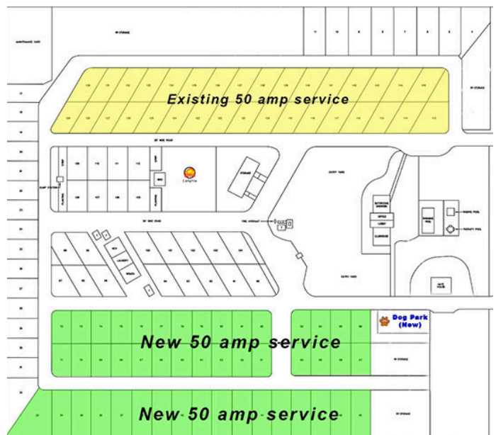
Sites being upgraded to 50 amp service

Even with all this going on we still have plenty of available sites for visitors. Summer evenings in the desert are beautiful and all around us there are