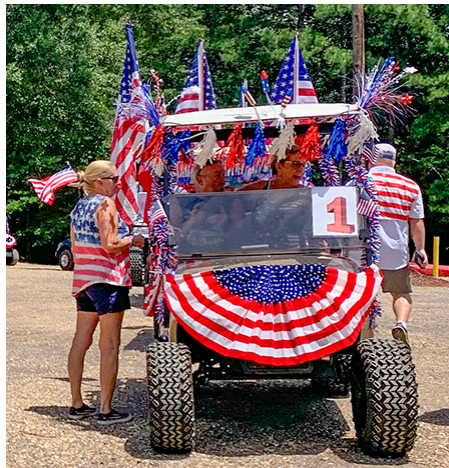
Got cart decorations

Activities are planned for everyone throughout the day. Our newest and most popular activity