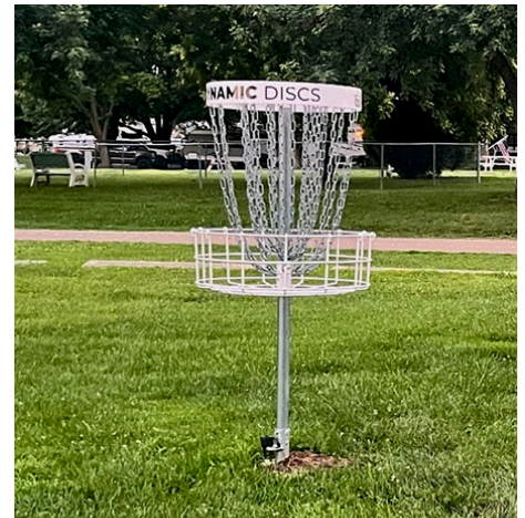
Get ready for frisbee golf!

Over the last couple of months, we have moved the volleyball net to the side of the clubhouse, started