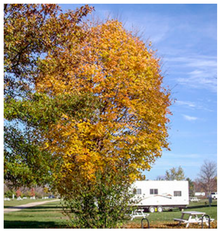
Autumn leaves keep us busy when they fall!

Year. For those of you who are interested in a seasonal site next year please let me know soon.