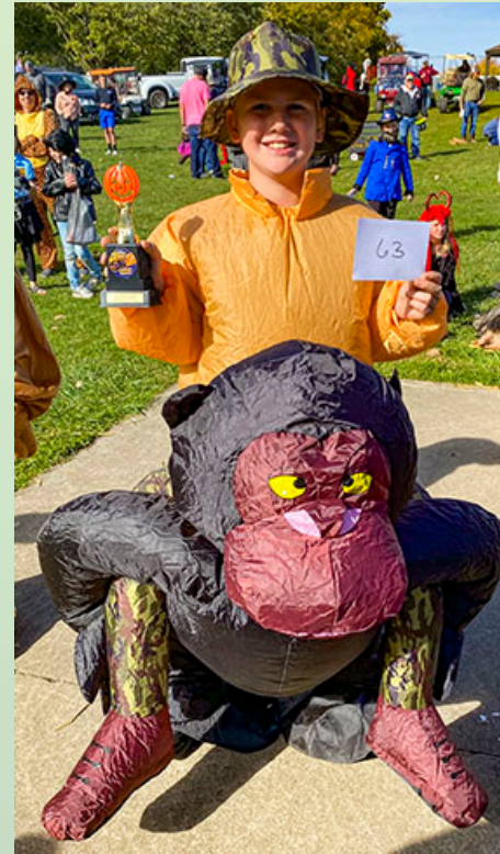
Funny contest winner Age 11-17