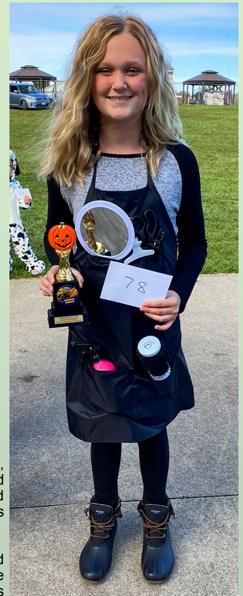
Most Original winner Age 11-17

With activities such as Trick 'r Treat, costume contests, kid crafts, and the new and improved Haunted Walk in the Woods, there was something for all ages.