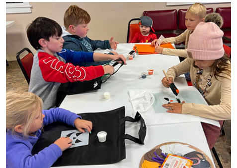
Kids love crafts

which we are most proud is the complete remodeling of our Event Center. With the enclosure of this