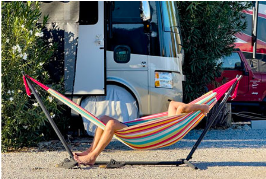
Catching some of that warm desert sun!

their management and member service experience into high gear.