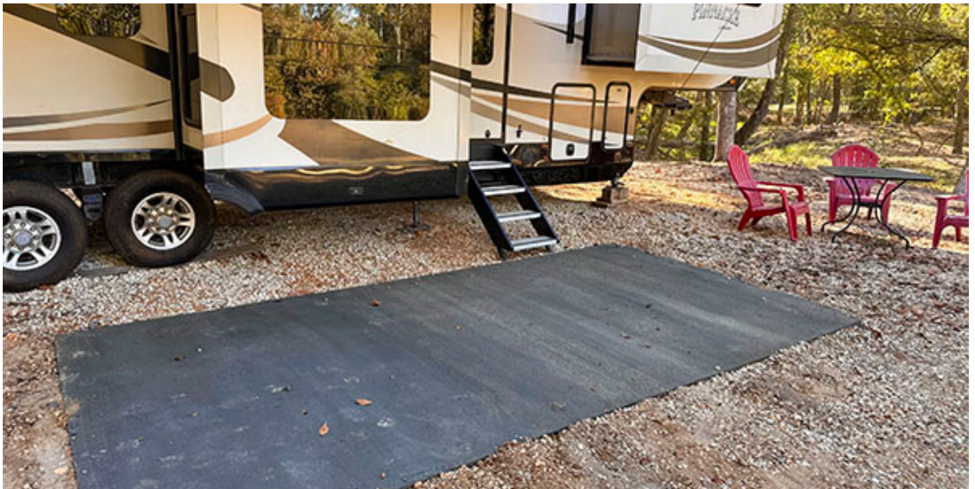
One of our new concrete pads