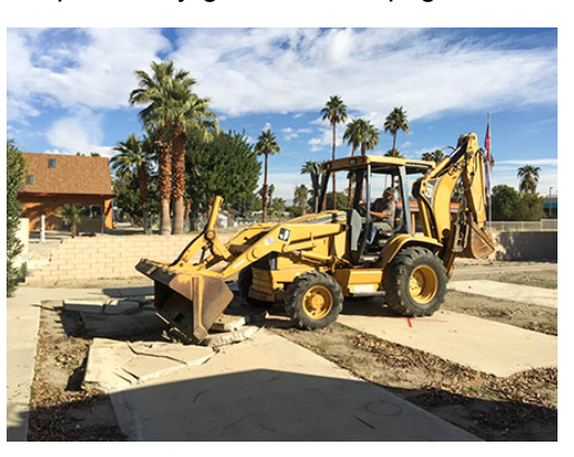
Dog park construction

As part of our continuing upgrades to Cathedral Palms, we completed the demolition work