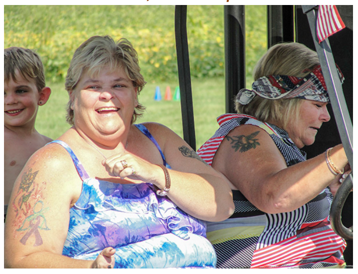
It won't be long before we'll be having Summer fun

We always seem to have a hard time finding lifeguards so if you know of anyone have them call me.