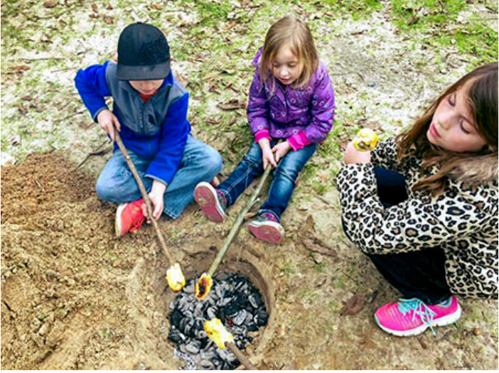
Nothing better than making campfire treats

and enjoying life. February is unquestionably the "Month Of Romance"! With Valentine's day weekend upon us, forget all that predictable stuff and whisk the love of your life away on a romantic camping getaway they will never