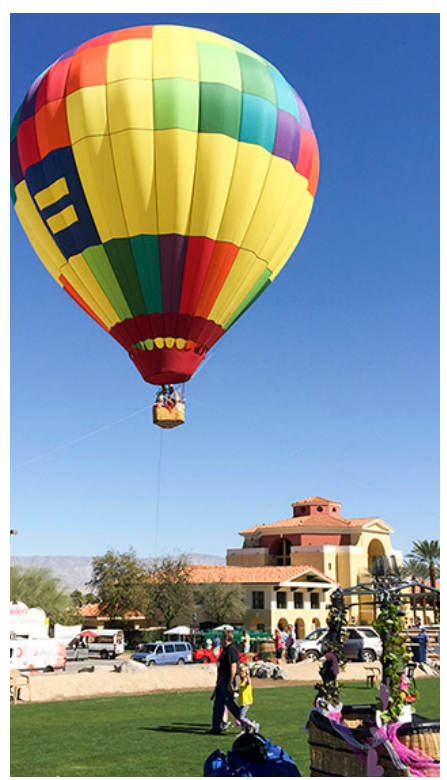
"Love is in the Air" for Valentine's Day

Beginning at 5:30 pm, treat your significant other to a Valentine's Dining Experience atypical of a crowded restaurant at the Sunset Wine Dinner & Balloon Glow.