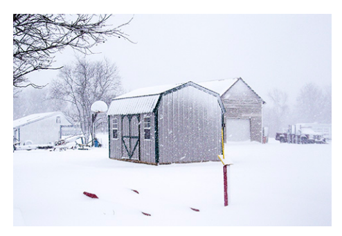
Our new shed

We also have a couple inches of snow on the ground. That might not seem like much but with high winds it's blowing the snow everywhere. Of course it came just in time for the Vandalia RV show. The weather