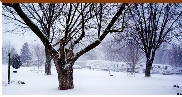
Even with the snow, we're still open for business