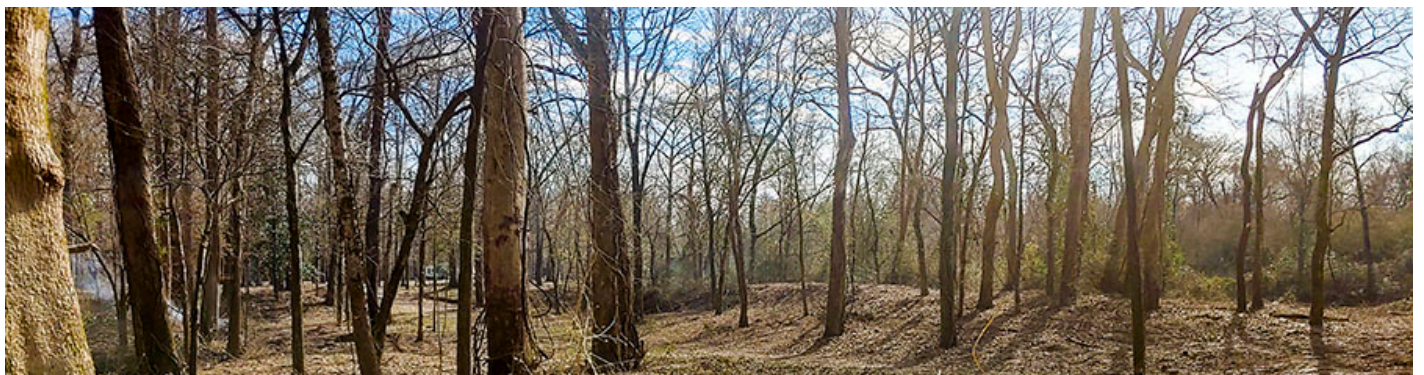
Clearing this area will make way for more primitive tent sites next to the river