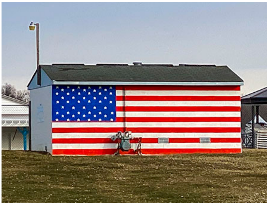
Our beloved Stars and Stripes on the pool pump house