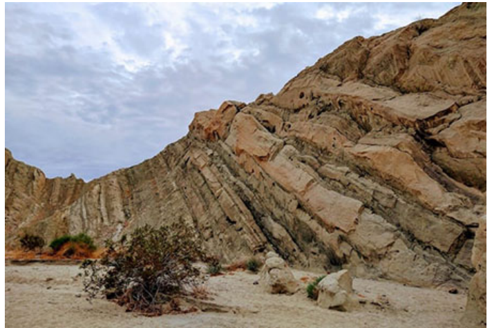
Along the East Indio Badlands Trail

If you're looking for more physically challenging pursuits, our valley has some of the most spectacular hiking trails in the country. The East Indio Badlands Trail is the most recent hiking trail addition to the