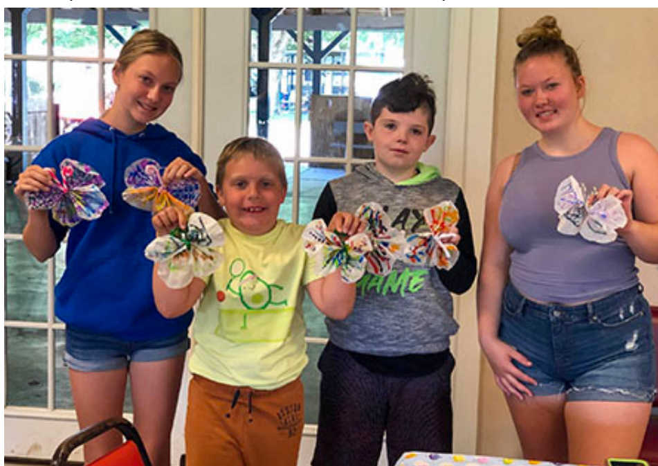
Kids proudly displaying their craft creations