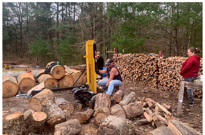
Bush Family helping out