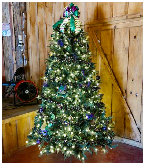
Mardi Gras tree