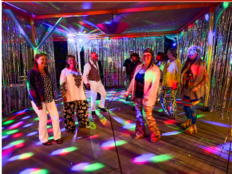
It was Disco Night for the Studio Over 54 crowd!

evenings were made even more enjoyable by introducing some new entertainment.