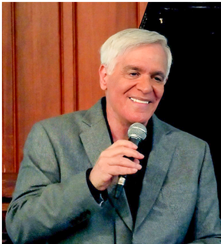
Singer Jimmy Danelli

Summer season promises plenty of activities packed with fun, laughter,