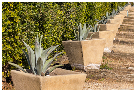
New plants at the entry