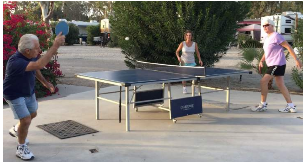
Table tennis is a great way to have fun staying fit