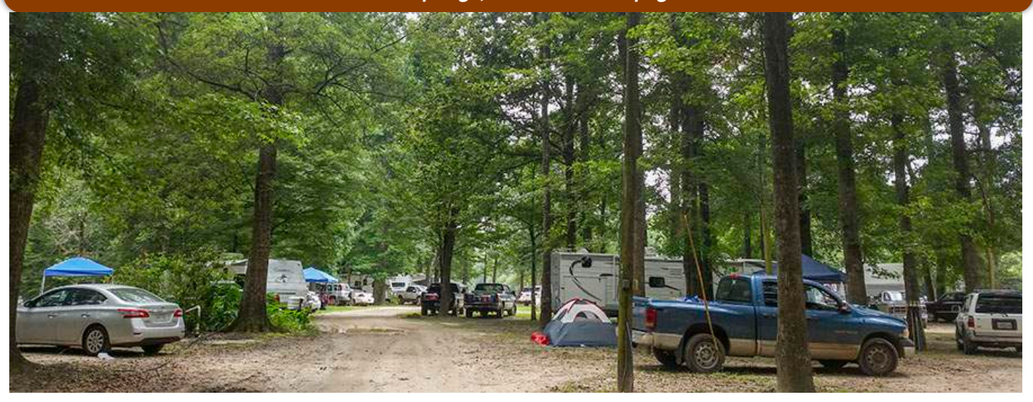
A great place to bring the family for outdoor fun

relaxation and memories to share. We are looking forward to hosting our returning friends and looking forward to adding a lot of new ones.