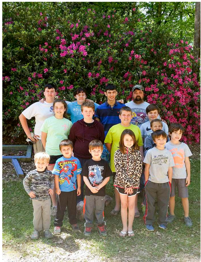
Everyone has a good time here

With the passing of 2015, I would be remiss if I did not recognize the hard work and dedication that our staff and