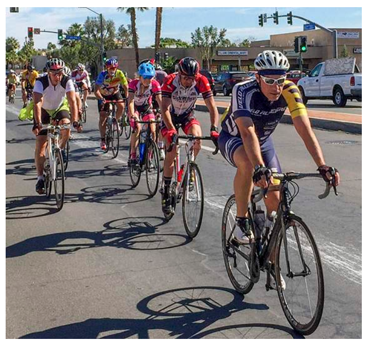
The Tour de Palm Springs bicycle ride

For those of you who prefer a more active event, we have just the thing for you - the Tour de Palm Springs bicycle ride on January 23. Originating in January of 1998, with 400 cyclists, the event has grown to include more than 8000 riders on routes ranging from five to 100 miles. In 2015 the Tour raised $179,000 for 80 local charities and has raised nearly $3 million since its