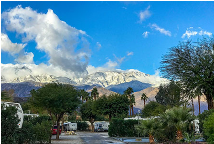
Our desert version of White Christmas

pooches out there being able to run and play off leash while their humans chat and get to know each other.