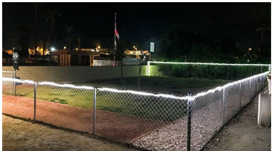
The Dog Park is nicely lit for nighttime duty