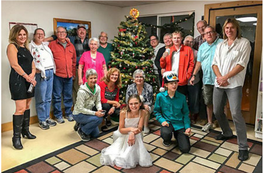
Our Christmas partiers with the tree we just decorated

Work on the remodel of the lobby and registration office is moving right along and while it's taken longer than expected, it's going to be a beautiful