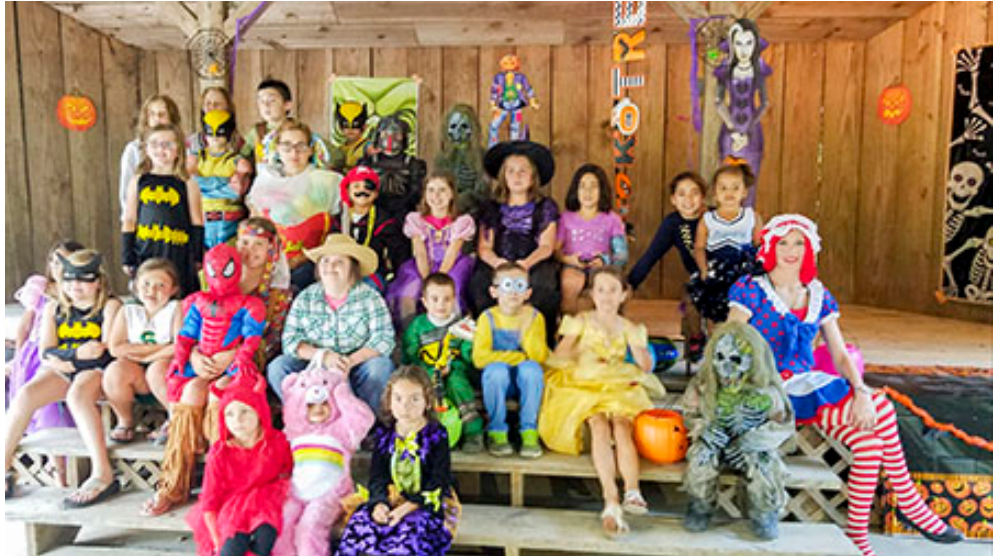
The kids always go all out with costumes for Halloween

We have many fond memories of our campers including our treasured Be Backers and First Time Guest. We have enjoyed watching all the families come and go and having fun through the year. I would like to thank our staff and all our volunteers who are so much of a part of the Hidden Springs camping experience! Their friendly demeanor and willingness to help makes this a special destination. We appreciate everything each of you have done to make this past year a success and welcoming to all. We wish to extend our warmest greetings and most humble thank you to family, friends and patrons of Hidden Springs. It is because of your appreciation as shown by return visits, great reviews, kind words of mouth and sometimes a special hug that makes us love what we do.