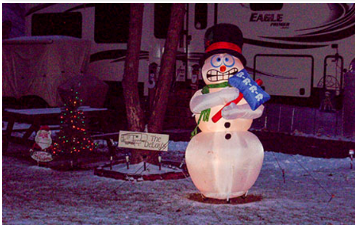
How cold was it really?