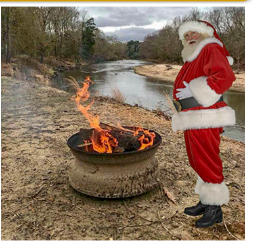
Santa loves campfires too!

Spring will be here and camping season will be going strong. We have RV sites, tent sites, cozy cabins, lots of activities and a DJ every holiday April