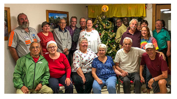
Our Christmas party/decorating group

desserts. As you can see, no one went hungry and everyone had a good time eating, decorating and just generally enjoying each other's company!