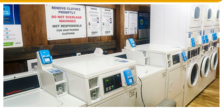
All new laundry room

The estimated completion time for the construction is two months so we expect to be ready for the season to begin April 1. We have also added two additional washers and dryers to our laundry room.