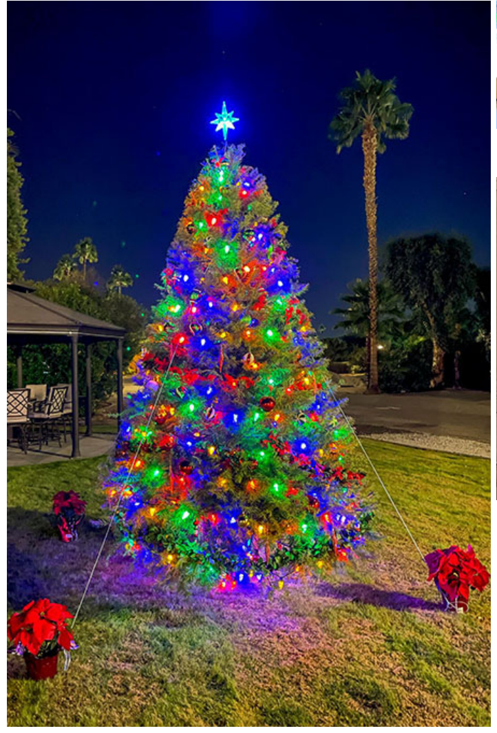
Now there's a Christmas tree!

Regardless of the challenges, we are charging full speed ahead to add more amenities and improve