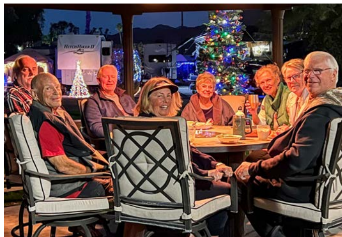
Happy Hour friends

Corporate Office, not online. Our busy season runs from November to March so to assure yourself a site, it's best to make your plans as early as possible!