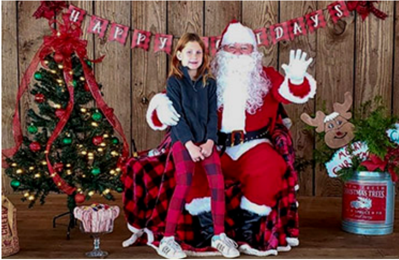
One happy young camper with Santa

when we are going to make that big announcement on our themed weekends!