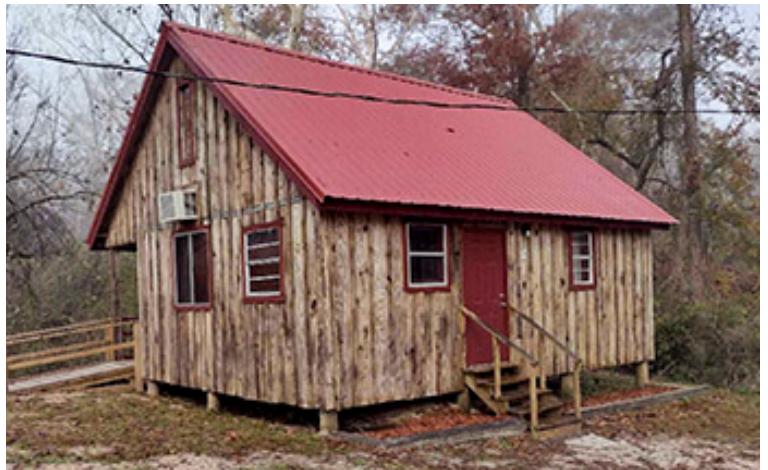
New roofs for the cabins