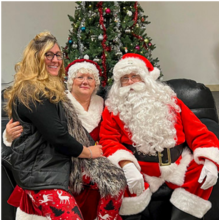
Mrs. Claus joined Santa this year

Santa was able to bring a bit of cheer to our holiday get-together early in December. Great food and fun games were enjoyed by those who attended. Also, campers decorating for the Christmas decorating contest brought a little bit of brightness in an otherwise gloomy season.