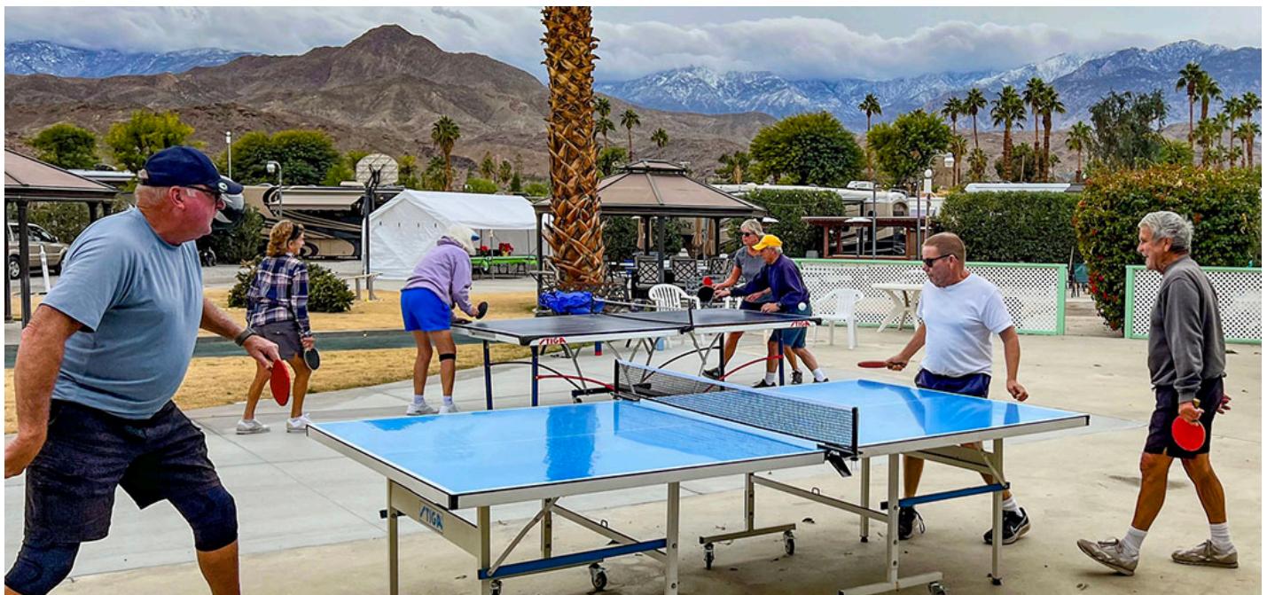
Snow on the local mountains and hot games of ping pong on the resort