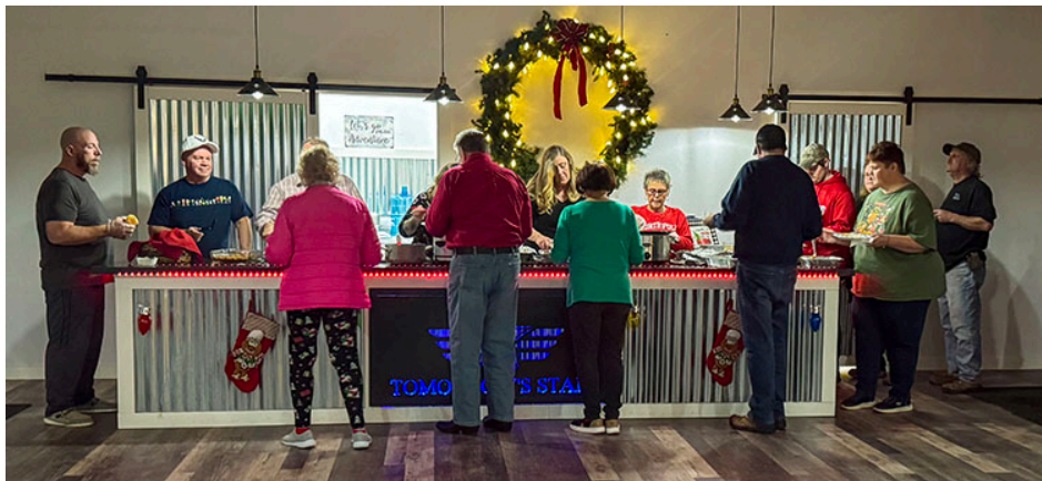
Great food and festive decorations for the Christmas party

We've now wrapped up 2024 so now, let's make 2025 a year full of exploration, relaxation, and unforgettable memories. Here's to an amazing year ahead!