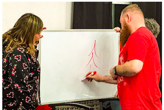
Christmas Song Pictionary

plan for all the great outdoor adventures that await you in the year ahead. Whether you're an outdoor enthusiast, a seasoned