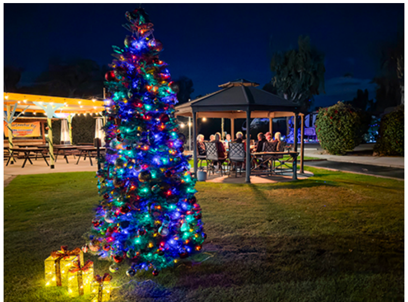
Our 2024 Christmas Tree

and decorating our traditional, real, live Christmas tree on the Social Center lawn.