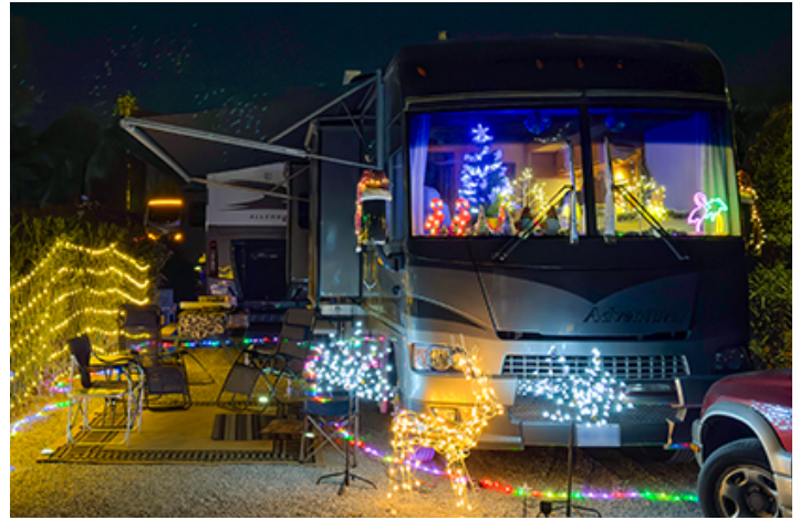
It was a tie! Site 40 (left) and Site 105 (right)