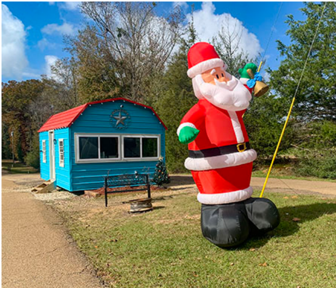
The new Guard Shack has a drive thru window

new members, we opened our new Snack Shack at the front pool. This was a big hit with all of the campers. Soft Serve Ice Cream and Hamburgers were the menu items that campers flocked to enjoy.