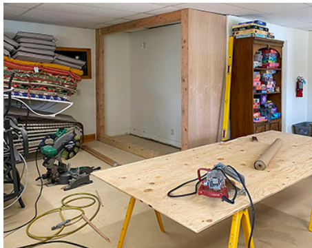
New clubhouse cabinets

Even with the "Stay Safe Ohio" order in effect, we have been able