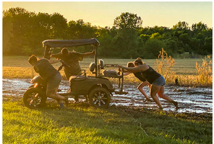
Sometimes you ride, sometimes you push!

Memorial Day was our kickoff weekend with a full park. We started the weekend off on Friday evening with a Wii Mario Kart competition. We got creative and used hula hoops, 6 ft apart as a distancing tool, so the kids and adults were able to stand in their hula hoop and race around the track. Saturday morning was started with a drive-thru breakfast which included pancakes, sausage, sausage gravy and biscuits. We were able to serve our campers as they drove up on their golf carts and cars or walked up. Next was our family craft. Campers were able to come up and sit at designated spots laid out at picnic tables using tablecloths placed 6 ft apart. They made wood signs that they could display at their campers. We were able to still have our poker run while maintaining social distancing and had a huge turnout for our decorative Memorial Day golf cart parade. We ended the evening with a drive-in movie, "Top Gun". There were cones set up 6 ft apart for the golf carts to park behind and hula hoops, 6 ft apart, for the