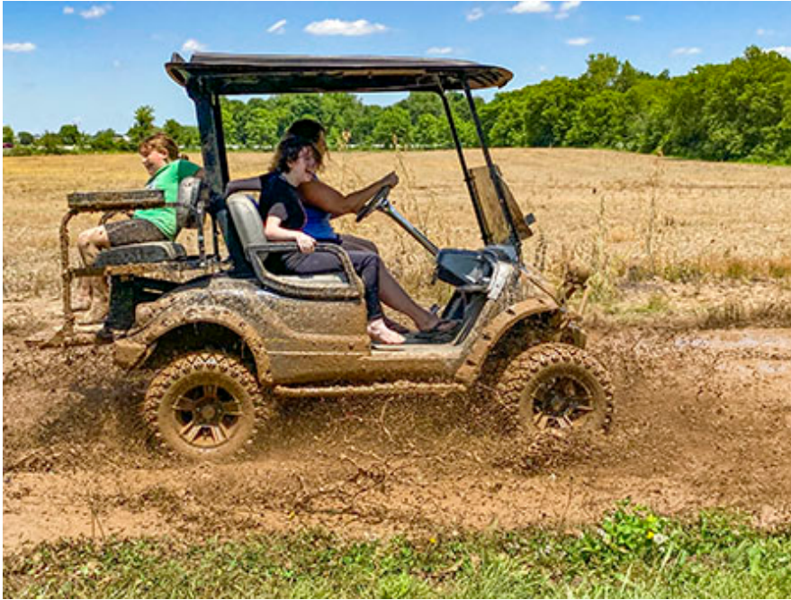
Roarin' through the mud!

campers who just wanted to bring a blanket to sit on.