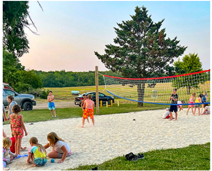
Kids enjoying the new sand volleyball court

We're about to come up on some of our favorite themes in the next couple of months. For July we'll