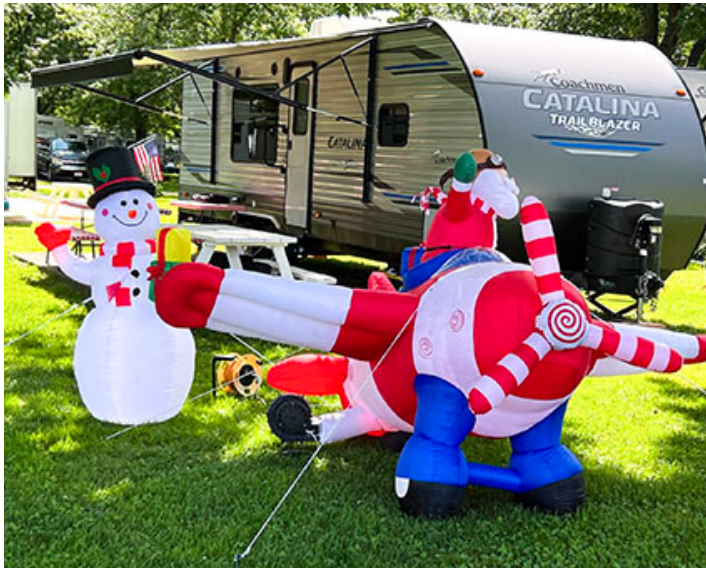
Christmas in July decorations

in the park, and we still have four more yet to come this Summer.