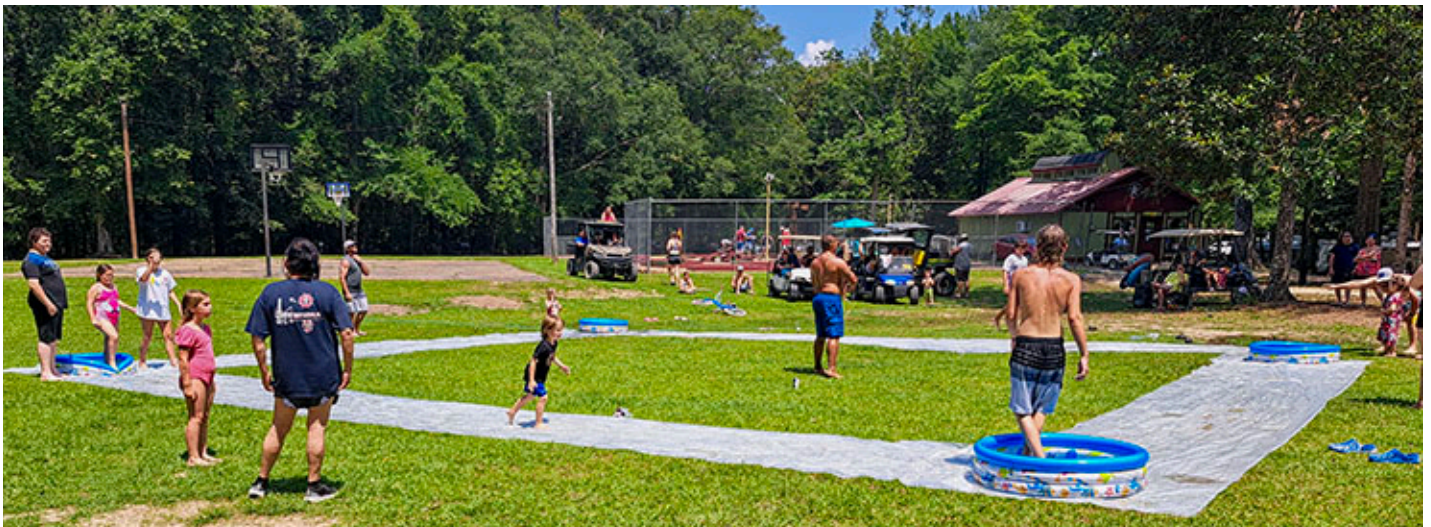
Water Kickball - one of our favorite activities for Summer