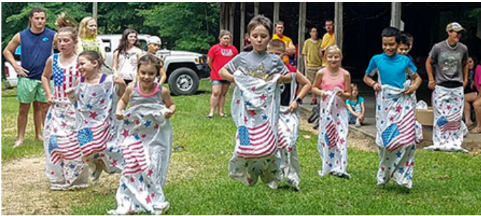
Sack races are always great fun

big one or just sit around a cozy campfire and relax and talk about old times. Whatever you decide, I'm sure dad will enjoy his weekend and make memories that will last a lifetime.