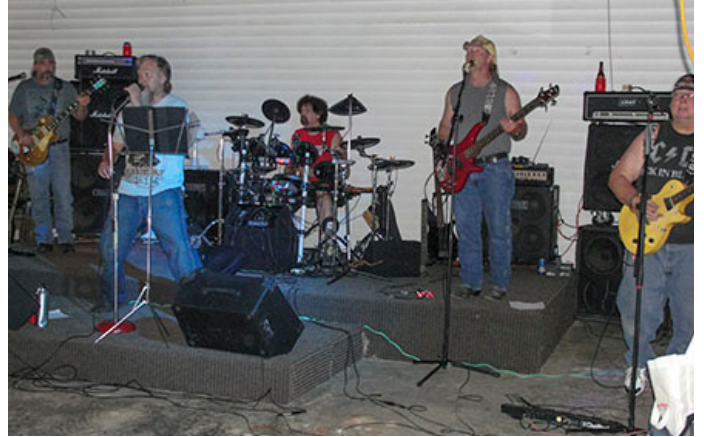
Entertainment by Jagged Edge

mow grass, weed eat, pick up tree debris and clean up around the new patios. They are repairing the old