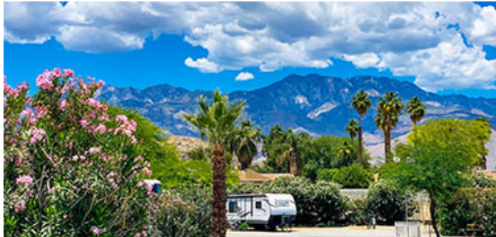
Beautiful Summer clouds

headed to the majors. Opening night was May 31 and the games continue into July.