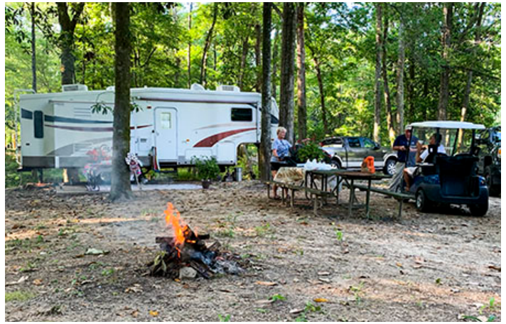
Days by the campfire make life worthwhile

pruned as we continue to clean up and improve the park for your enjoyment.