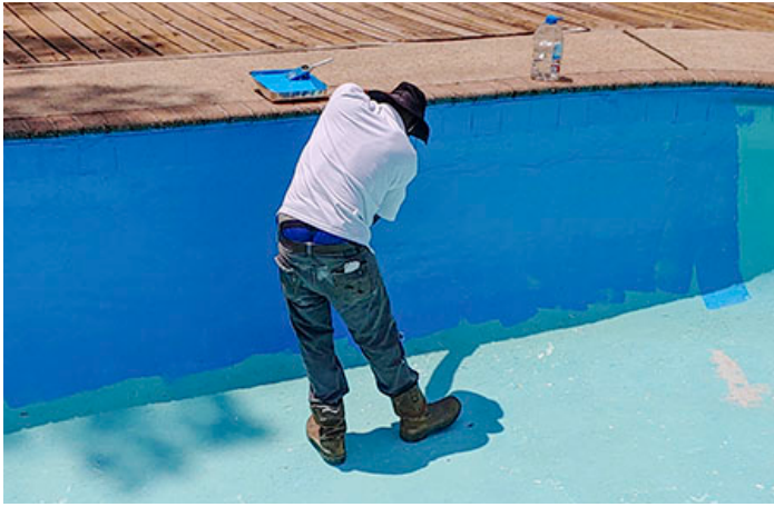
On pool up and running, one more to go!

pruned as we continue to clean up and improve the park for your enjoyment.