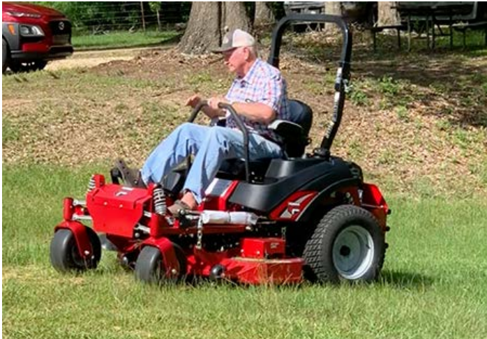
Our new mower is getting LOTS of use!

Both of our pools opened for Memorial Day weekend. We are very pleased with the abundance of reservations pouring in for the weekends and we are excited about that visitors are coming to visit and tour the park.