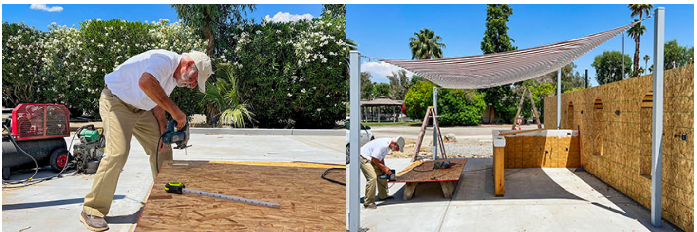
'Uncle Bob' continues work on the Premium Site.