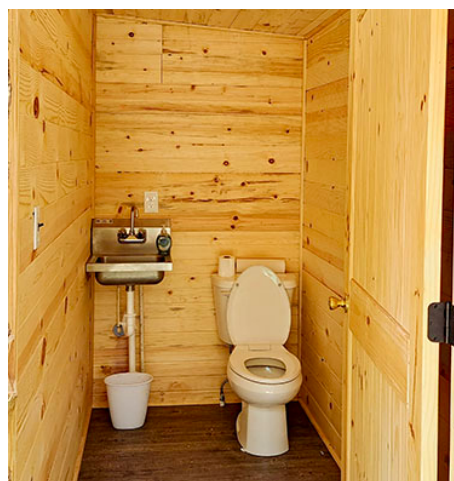
New Event Center bathroom

There are still a few finishing touches to complete but the Event Center will