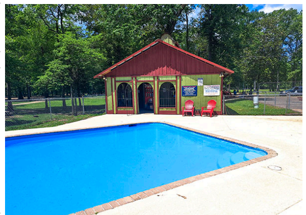
Our beautiful refurbished pool