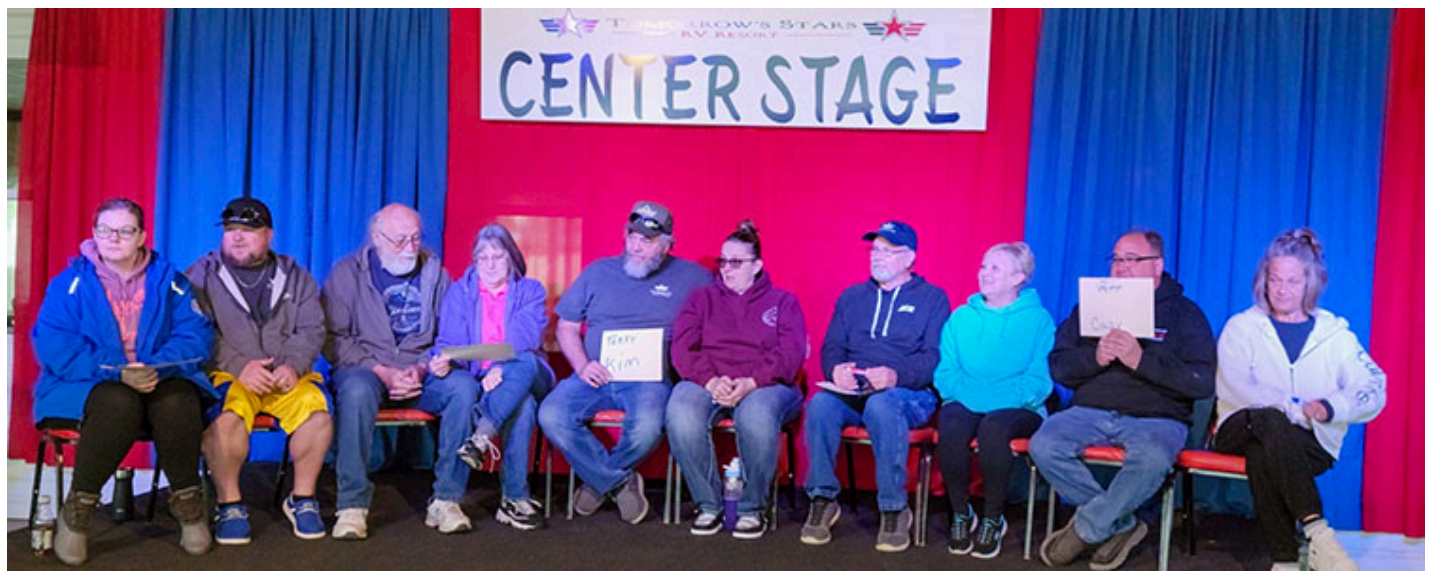
The "Not So Newlywed Game" proved to be popular during Game Show Weekend