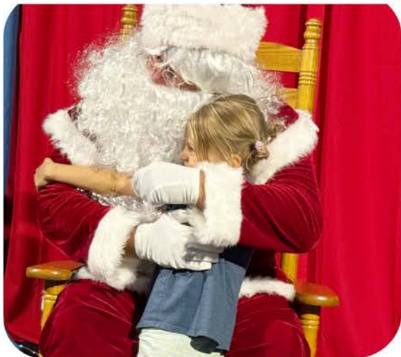
July 25-26: Christmas in July

Come celebrate summer with us—we can't wait to see you at the next event!