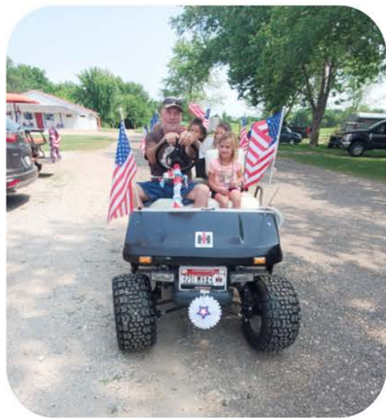
July 3-6: Independence Day Celebration