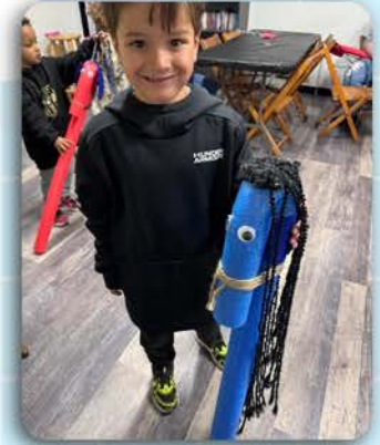
Kentucky Derby at Tomorrow's Stars