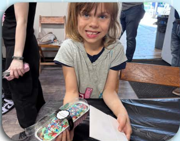
Making Mother's Day Cakes

Enjoy the campground Thanksgiving Dinner and spend time with family and friends around the campground.