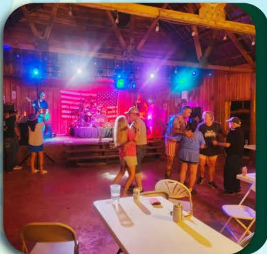
Dancing to The J. McCart Band on Memorial Weekend