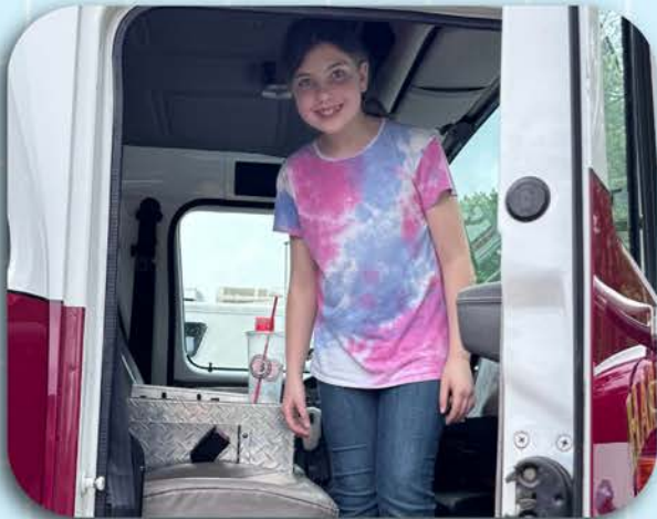
Checking Out the Fire Trucks on Heroes Weekend

Summer fun is in full swing, May has been a great month so far with wonderful turnouts for Kentucky Derby Weekend, Mother's Day Weekend and Hero's Celebration Weekend, and Finishing with Memorial Day, we're excited to keep the fun going! June is packed with exciting weekends for the whole family to enjoy at Tomorrow's Stars RV Resort. From old-fashioned cooking and family celebrations to hilarious pool races and a campground Thanksgiving feast, there's something for everyone this month. Be sure to reserve your campsite and join us for these unforgettable June events!