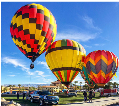
"Love is in the Air"

The 4' x 8' barbecue grill will be fired up and filled with half-pound steaks cooked to perfection. In