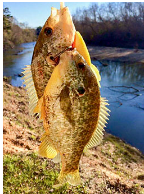
...and her fish

This month has several occasions for all to enjoy. First, Spring Break, a whole week for a family camping getaway. Festivals and parades will