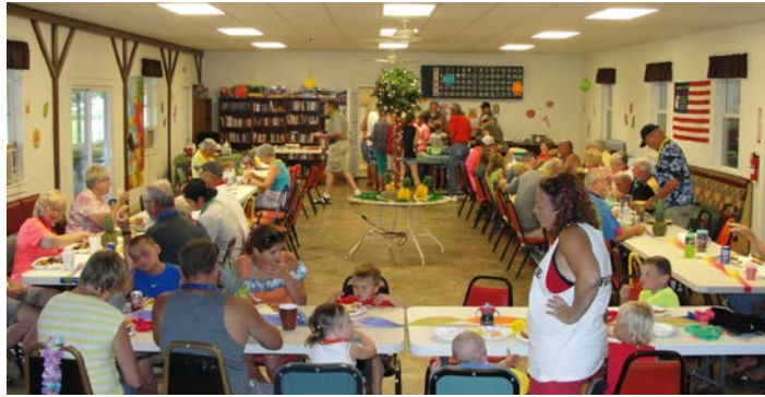
We can't wait for our members to return in Spring!

During the Winter we have put different locks on the shower house and laundry room. Those of you who will be using these buildings will need to get the combination from the office. We also should have