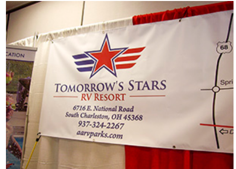
Our show banner

We're all tired of this back-and-forth Winter. One day you have wind chills below zero and the next week it's going to be in the 50s. It's a wonder we're not all sick out