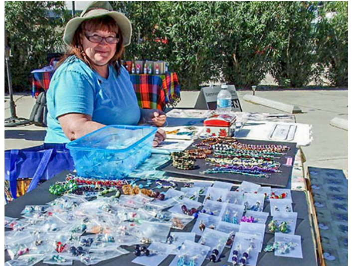
Handmade treasures at the Yard Sale

Valentine's Day here has become a much bigger event since the City of Cathedral City began hosting a balloon festival at the Civic Center last year.