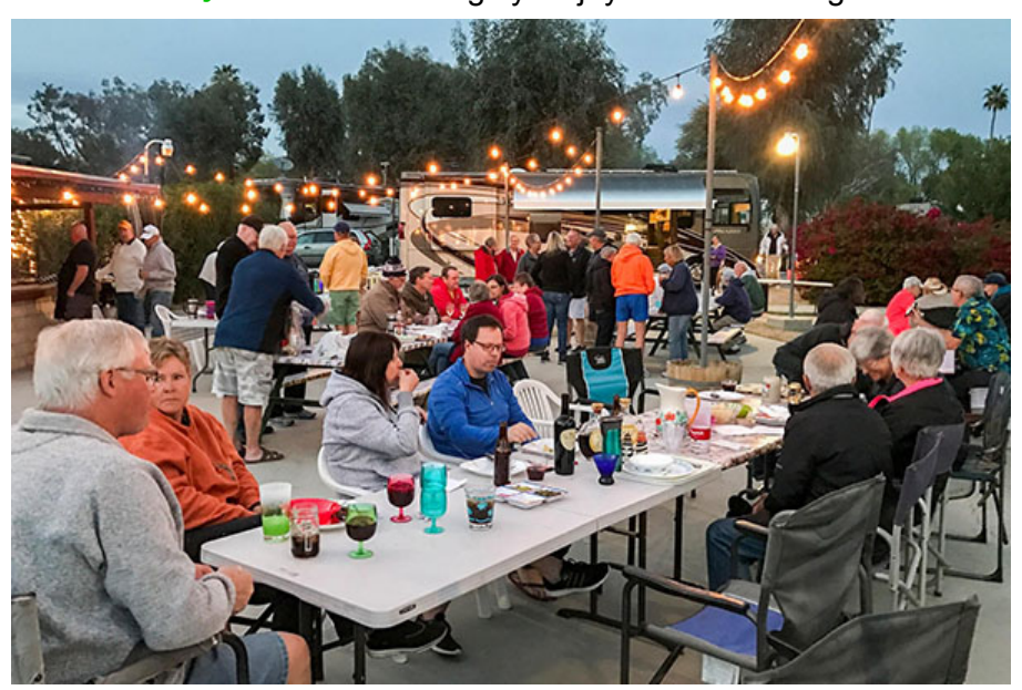
Packed house for the steak barbecue

We also added, with much success, a new restaurant to our Wednesday Night Dining Out event. Manhattan in the Desert in Palm Springs is a New York style delicatessen with an awesome bakery right on the premises. Twenty-six RVers thoroughly enjoyed the evening and we'll