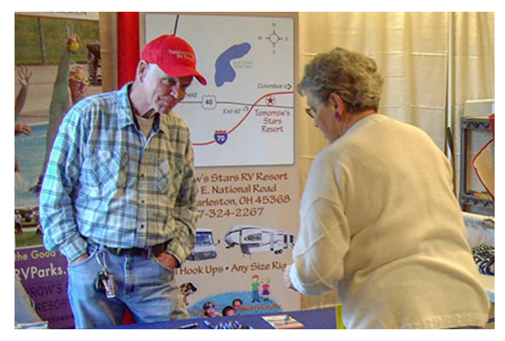
Promoting the park at the RV Show