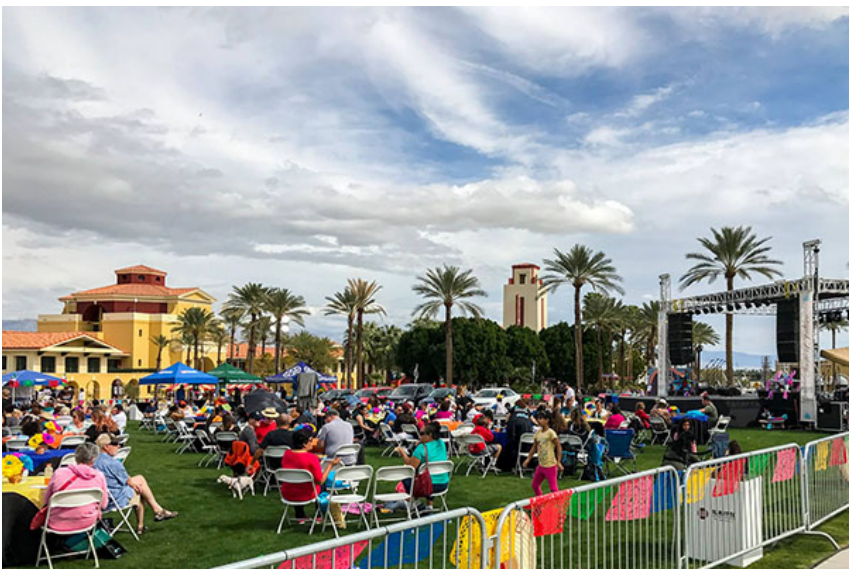
2nd Annual Taste of Jalisco at Cathedral City

February was also a celebration of Tequila, Jalisco, Mexico, the Sister City of Cathedral City. The 2nd Annual Taste of Jalisco featured music, dancing, movies and great food at the Civic Center. Many of us took the short walk to the festival on a sunny Saturday to enjoy all of