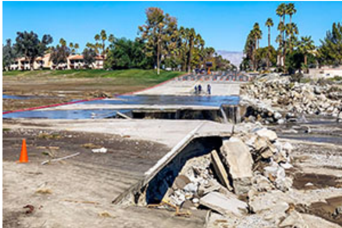
The day after...

With water flows estimated at 15,000 to 22,000 cubic feet per second (cfs), the roadway sustained significant damage. Repairs are underway to restore two lanes of the original four lane crossing, hopefully by the end of March. We're looking forward to