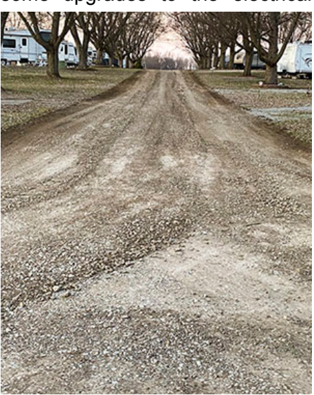
Ongoing road widening

We are doing our best to complete some upgrades to the electrical