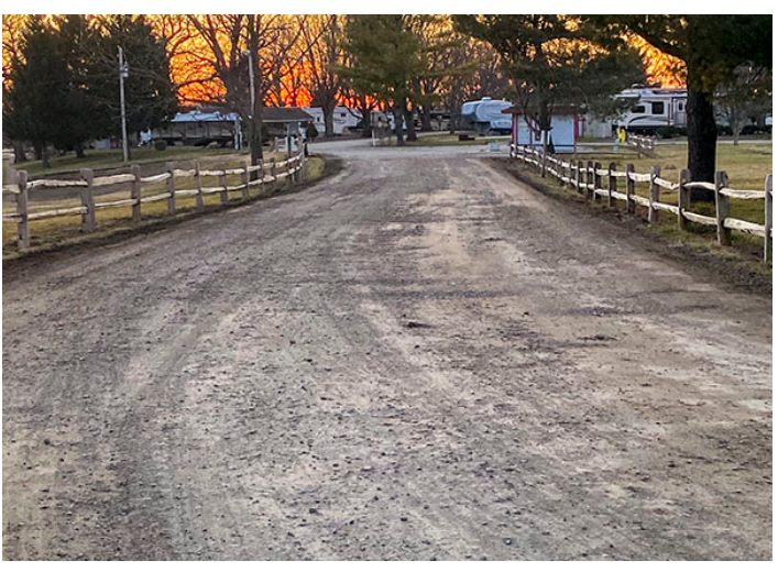
Widening roads for better access

ideas come to light. Our focus is family and the schedule will reflect that. The food events will continue to grow. We are planning two hog roasts again this Summer, along with three live bands, movies in the woods, and more drive-ins.