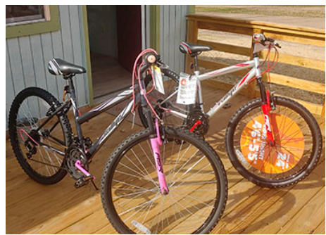
Easter bicycle giveaways

We will not only be open to our Hidden Springs guests but to the