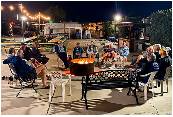
A campfire always makes for a relaxing evening

local restaurants. Fridays bring out the burger fans as we grill cheeseburgers, featuring our (almost)