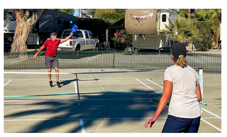
Pickle ball is a favorite here

One other area that has become popular, especially with the installation of gazebos, is the pool. We experimented by putting a portable barbecue in one corner of the enclosure and it immediately went into