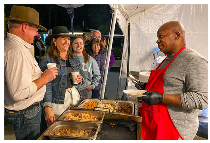
Choosing your taco filling...decisions, decisions!

Add to that the many outdoor cookouts at various RV sites and the aroma of great food wafts through the air all evening.