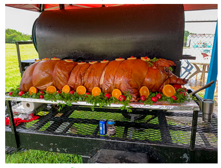
Who's ready for a pig roast?

current goal is to widen them throughout the park, making it easier to navigate through the resort. With