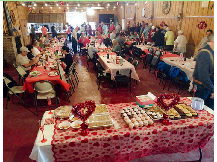
Delicious Valentine's Day Dinner

Our Mardi Gras Celebration is always a good time. We celebrated