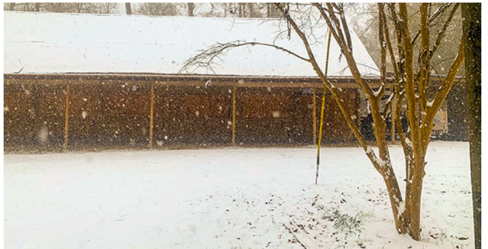
It snowed, Oh yes, it snowed!