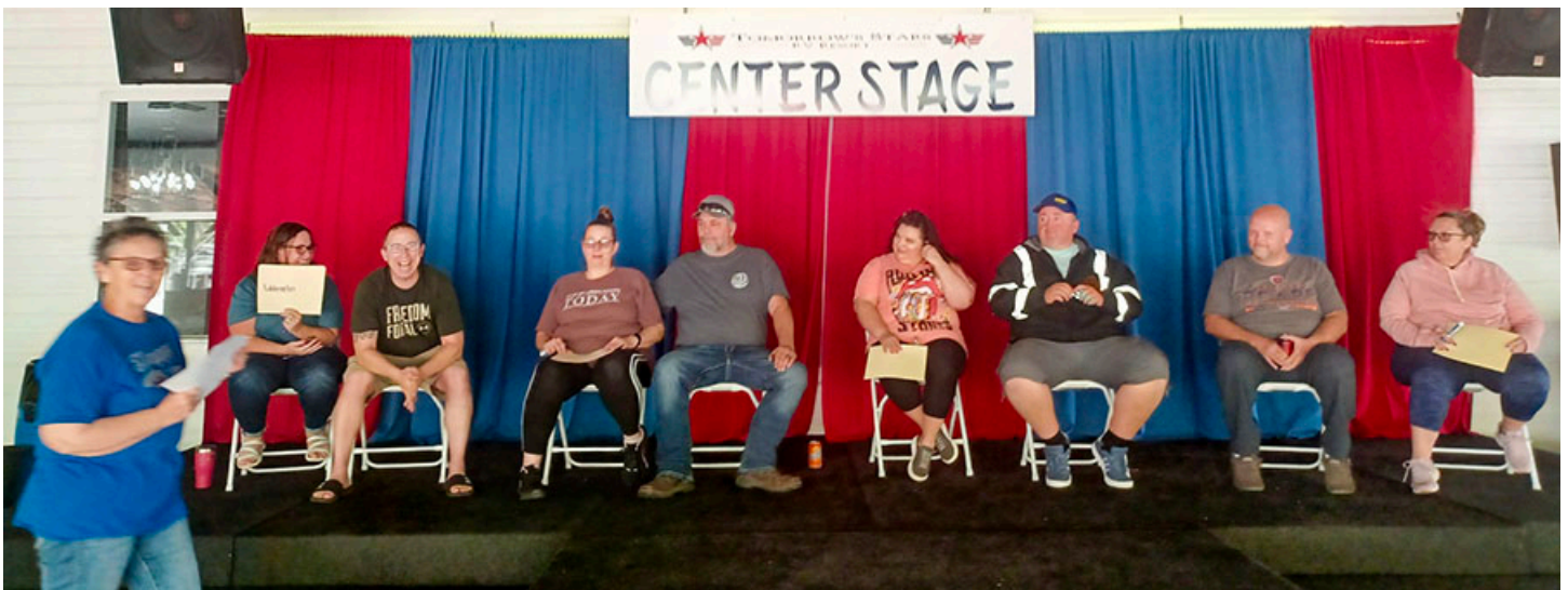
Welcome to the Not-So-Newlywed Game