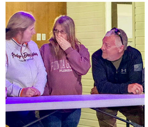
Family Feud - good answer!

record seven inches of snow and New Orleans had 12 inches. The week of February 10th had temperatures in the 80s. Let's hope March is more kind to us!