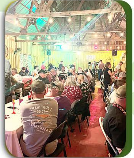
Packed House for Valentine's Dinner

We look forward to welcoming everyone back in the coming months and extend a sincere thank you to our employees and volunteers who have worked tirelessly—especially after the recent rains—to keep Hidden Springs looking its best.