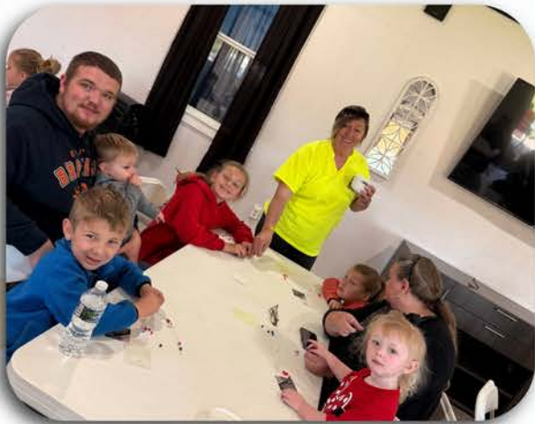
Kids Crafts getting exciting update