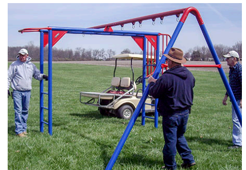
Setting up the new swing set

With all the rain we've had lately the grass has been growing fast