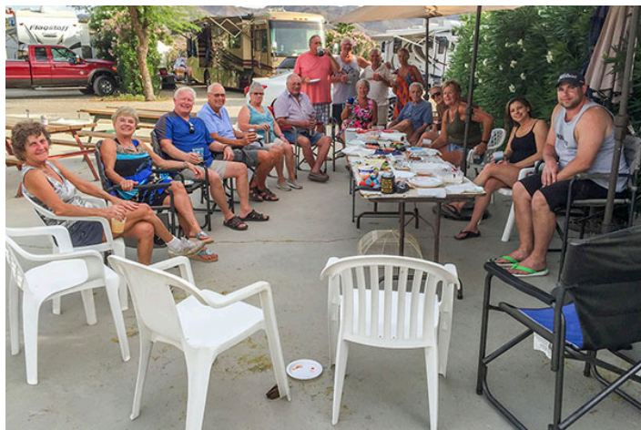
The final Happy Hour of the season