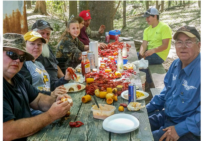
Surprise! Crawfish birthday celebration

May is here and that means Mother's Day and Memorial weekend are right around the corner. Treat your Mom to a weekend getaway. Let her