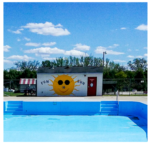
Our newly refreshed pool

The concrete work has been completed on 10 of our sites and at the swimming pool. We are now in the process of sand blasting the