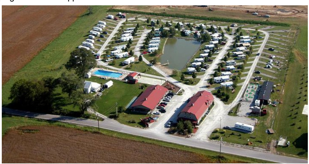
May 2017 • Page 2 of 4

The pond fish are always bitin', so don't forget the rod 'n 'reel when you come. Every Saturday morning there is a Fishing Derby for the little ones. We've stocked the pond with 500 pounds of catfish and then some, so come and enjoy a great day of fishing!