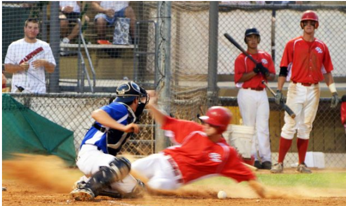
Power Baseball returns in June

Regardless of the Summer heat, there is still plenty to do in and around the park. Next month, baseball returns to Palm Springs. Palm Springs Power recruits