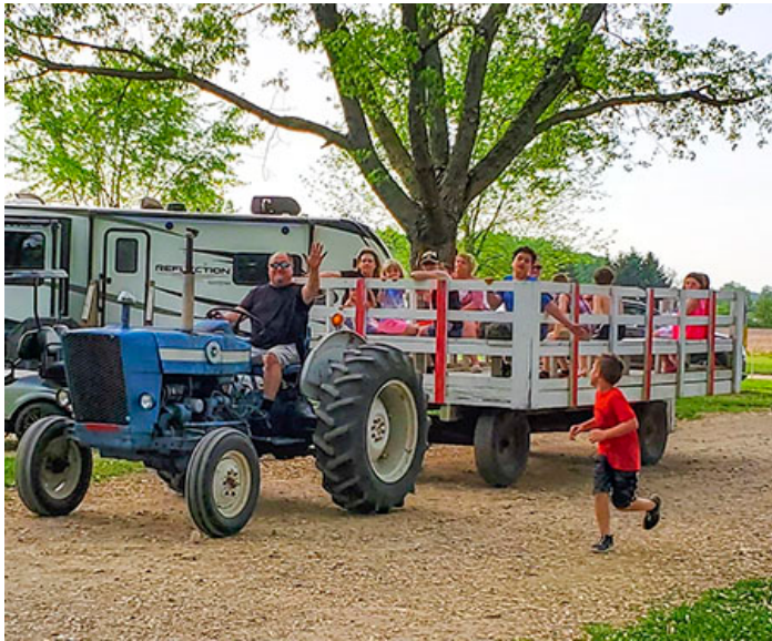
Wagon rides are always popular

April also took the wraps off our new themes for the 2022 camping season. We had some lucky players at our casino night during Viva Las Vegas Weekend.