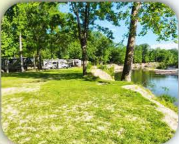
Riverfront Sites are Waiting for You

We’ve also continued making improvements around the campground following the flood. Much of the sand that was left throughout the park has been repurposed to enhance our creekside beach, giving it a fresh new look. The old and damaged playground equipment has been cleared, and we’re looking forward to installing new equipment soon. Our miniature golf course has also been refreshed with new turf around the holes. It’s looking better than ever and continues to be a favorite activity for guests of all ages.