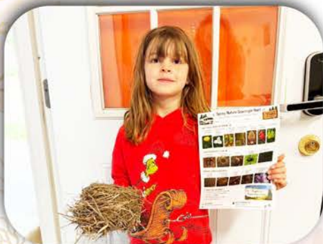
NEW Discovery Kids Program

Make sure to reserve your spot and be part of all the fun. May is one of the most exciting months of the season—you won't want to miss it!