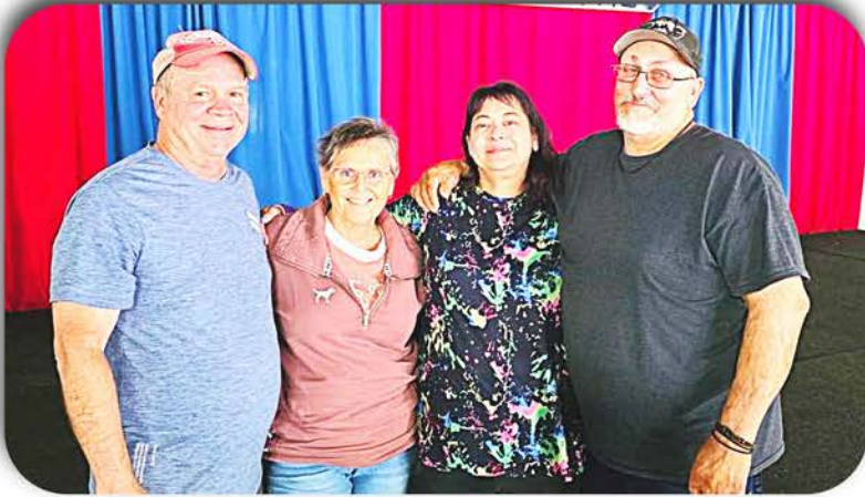
Name That Tune Winners