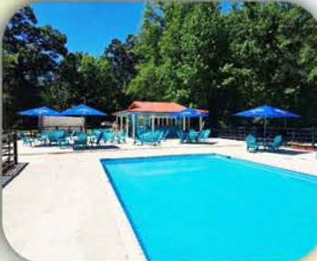
Pool & Snack Bar are Open for Business