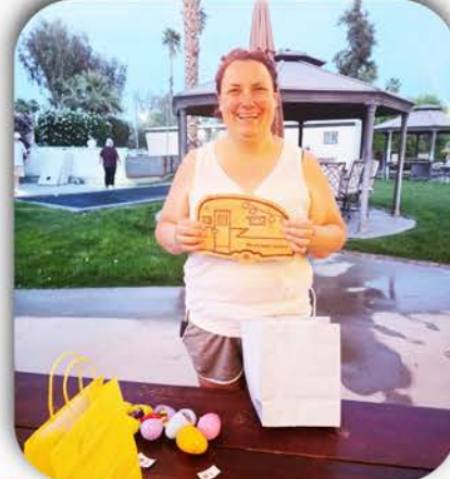
1st Annual Adult Easter Egg Hunt