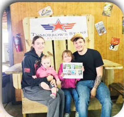
Scavenger Hunt Winners

Wrap up the month with a trip down to Louisiana—campground style! Enjoy a festive Louisiana Boil, join the colorful parade, and dance the night away at our Masked Dance Party.