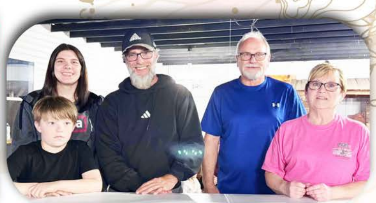
Family Fued Winners