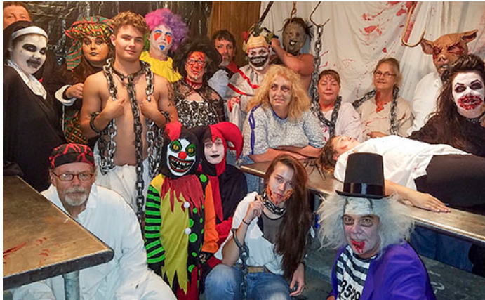
If this group won't scare the daylight out of you, NOTHING will!

Come camp with us and enjoy bicycling, walking along the creek, fishing in the river or just relaxing at your campsite sitting around a warm cozy crackling