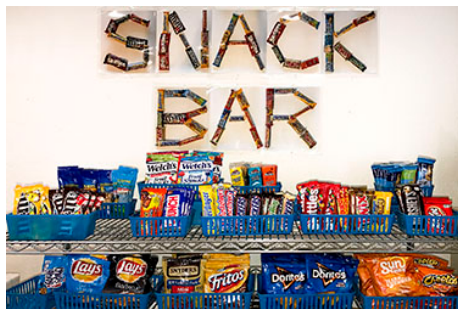
Bring your sweet tooth!

The weather cooperated for the most part, but as Hurricane Nate