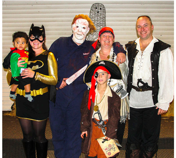
Members at Tomorrow's Stars REALLY get into Halloween!

judges to narrow down the first, second, and third place winners for each age group. The costumed patrons were then driven around the park in the haunted hayride wagons to rest up before Trick-'r-Treat and see up close all the work the campers did to decorate their sites.