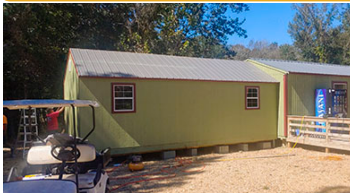
New store under construction

were without power for most of one weekend.