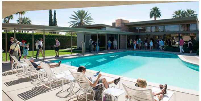
Frank Sinatra's "Twin Palms" Estate