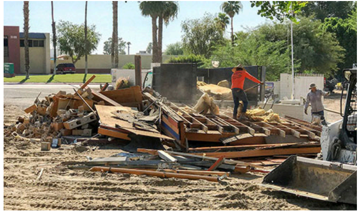
Big changes to the entry