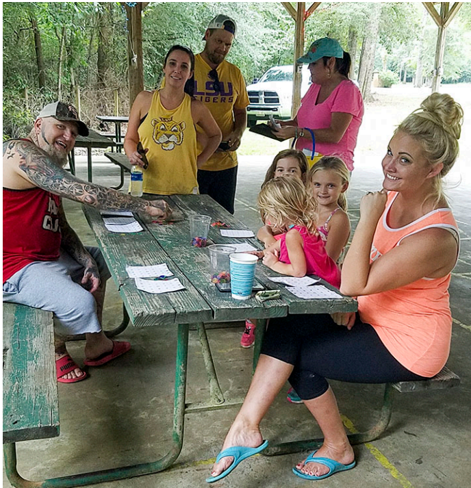
Having fun playing Bingo

park. Everyone has enjoyed feeding and watching them. White perch have also been biting in the river.