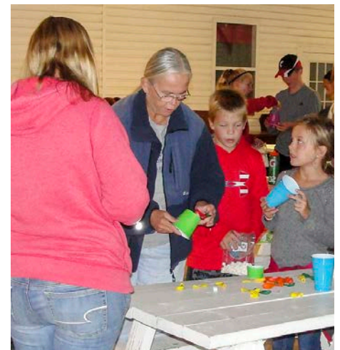
Making marshmallow shooters

We had a few who chose not to risk the weather and were