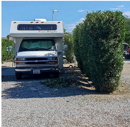
All of the Oleanders have been trimmed, trees next

The security building is gone and we've begun planting Arizona cypress along the driveway to enhance that very important first