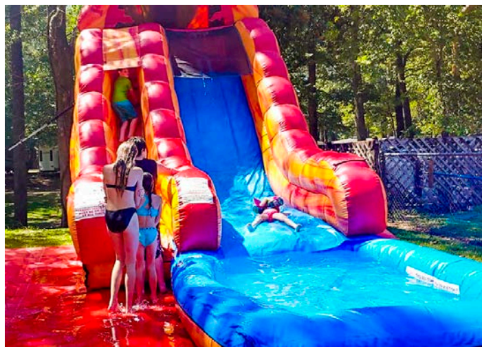
Cool fun on the bounce water slide

We will be wrapping up the month of September with a weekend of activities, including crafts, a cornhole tournament and a cook-out themed potluck!