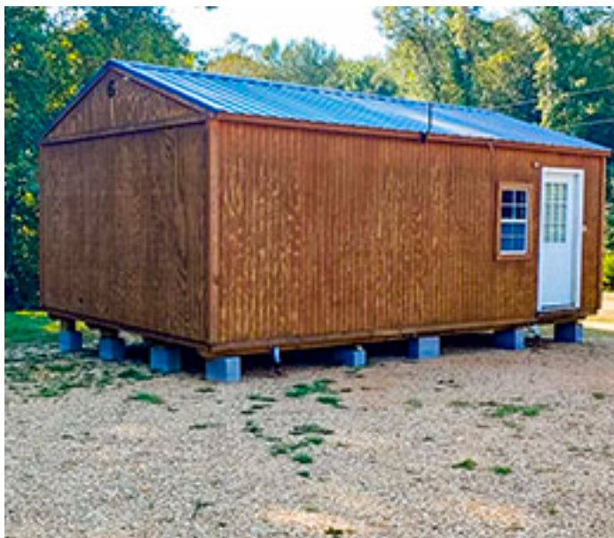
Our new permanent office will be ready soon