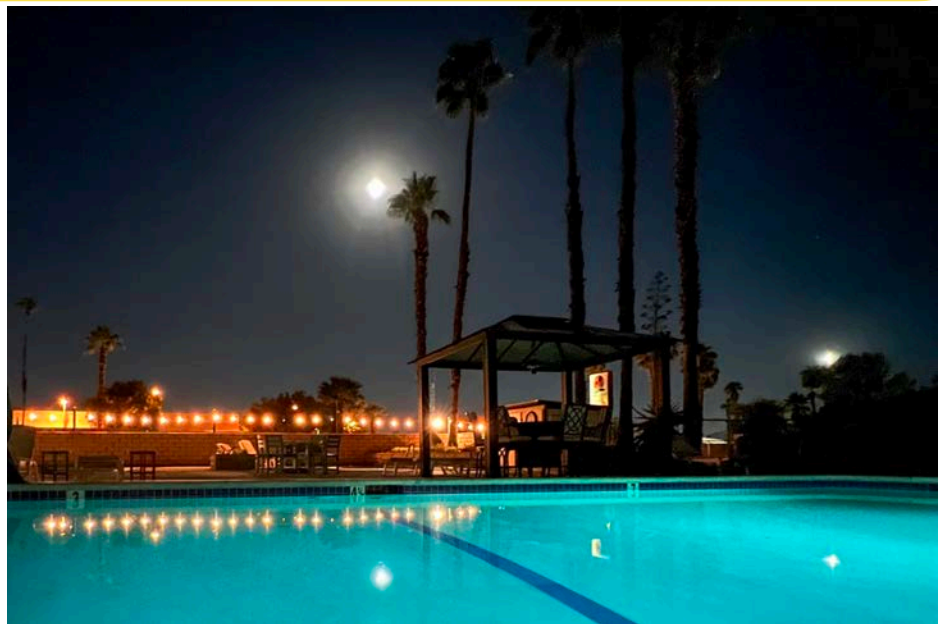
The heated pool, soon to be filled with smiles and laughter

For those AARVP Members who occupy the limited number of full service sites available during the Winter season, a reminder: if you have a reservation for this season ('23 - '24) you have the option to reserve your site for the next season ('24 - '25) so please, make sure you've taken advantage of this great member benefit or inquire when you arrive for the season. Time flies!