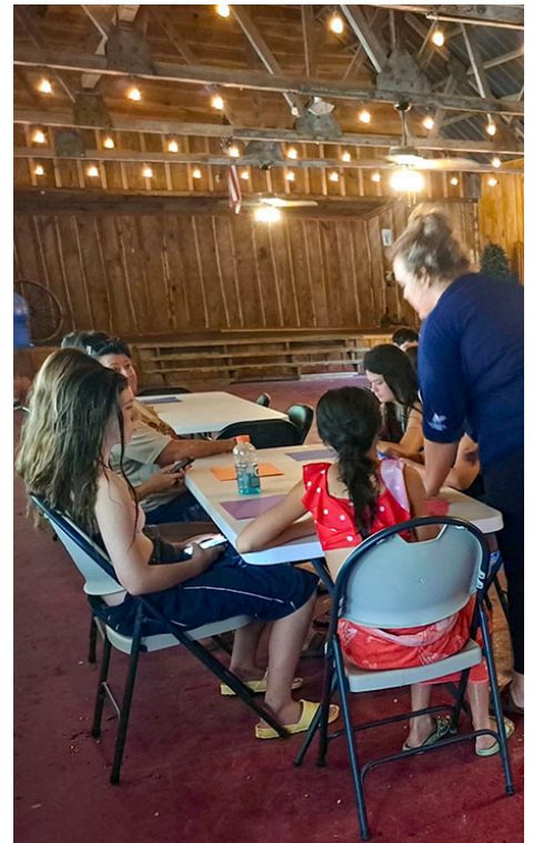
Time for Arts and Crafts