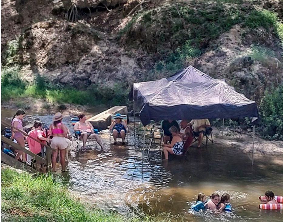
Cooling off in the water during 100+ degree weather

Our eagerly awaited new storage lot will be finished shortly and there has been quite a bit of interest from campers who want a place to store their RVs.