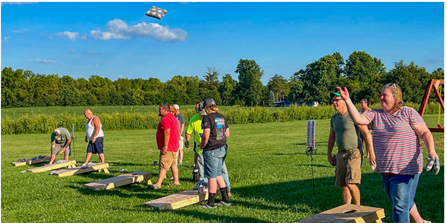
The Corn Hole Tournament brought out a lot of competitors