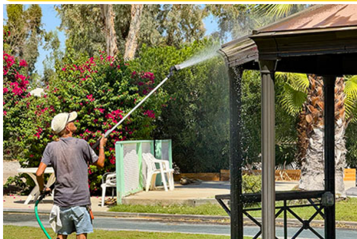
Beth cleaning the Social Center gazebos