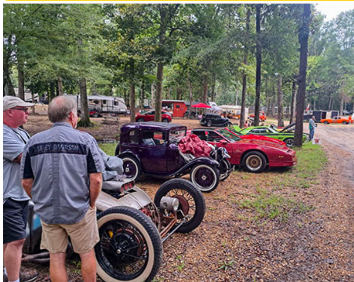
Something for everyone in the car show

The weather cooperated and it was a beautiful day to get out and enjoy Fall-like weather.