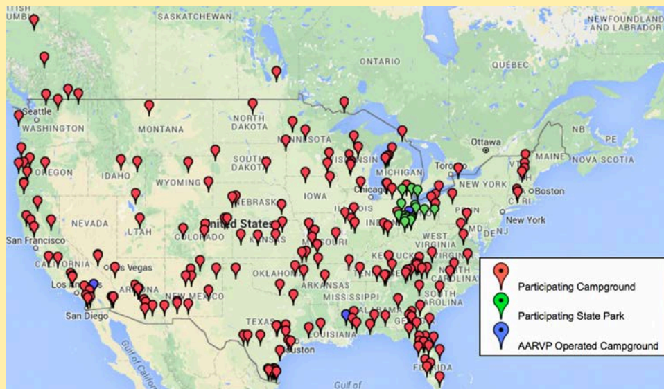
Cathedral Palms, continued from page 1

The All American RV Club is our growing network of RV Parks and campgrounds that offer significant discounts (most are 50% off their regular rates) to the members of All American RV Parks. There is no book to buy, nothing new to join or any additional cost to be part of this program - it's open to all members in good standing. Just show your current AARVP membership card!