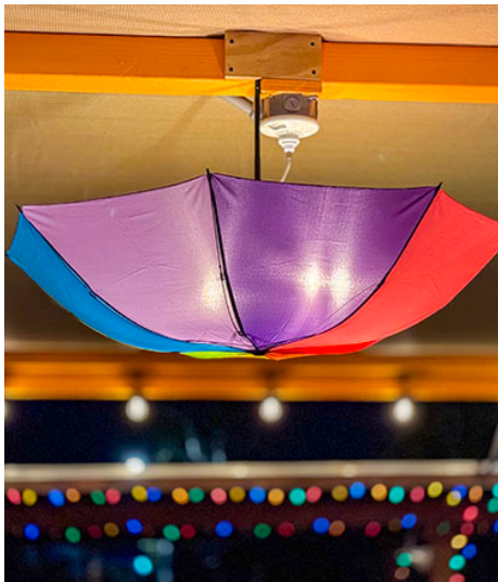
Pergola interior lighting

With the final campfires being extinguished, campers bid farewell