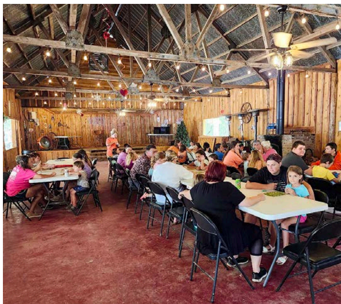
Kids Bingo had a large turnout

2024 will be New Years with Ransaak and fireworks.