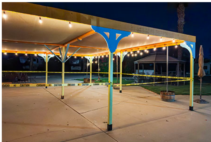
Uncle Bob's been busy this Summer!

be alive with activities, campfires and great food and drinks. And speaking of campfires, food and