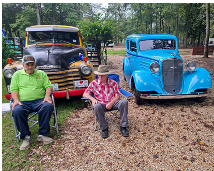
Couple of Chevrolets from different eras

The weather cooperated and it was a beautiful day to get out and enjoy Fall-like weather.