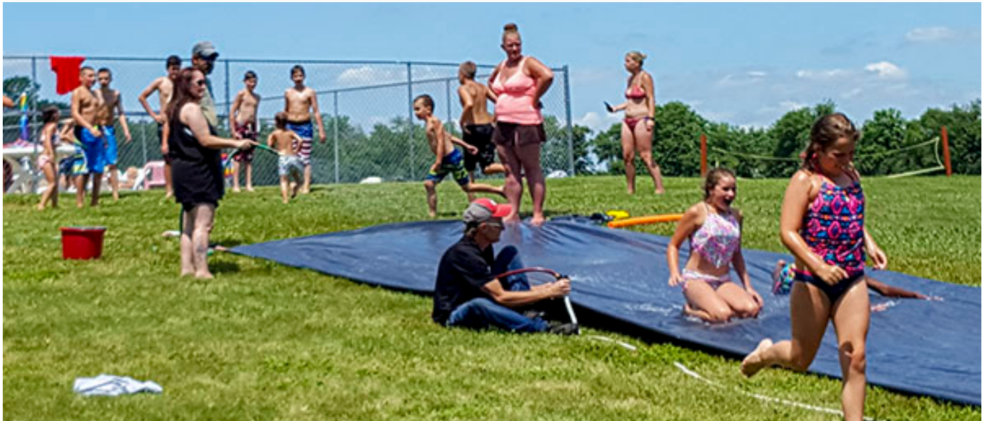
Take one tarp, add water and a slope and presto, you have a slip 'n slide

speaking with Santa and having him accompany them on a hayride. Gourmet marshmallows and iced hot chocolate made for a perfect day.