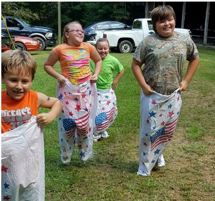
Sack races were one of many activities

Come camp with us and plan on having a relaxing, yet activity-filled weekend for you, your family and friends. You will have a choice of entertainment