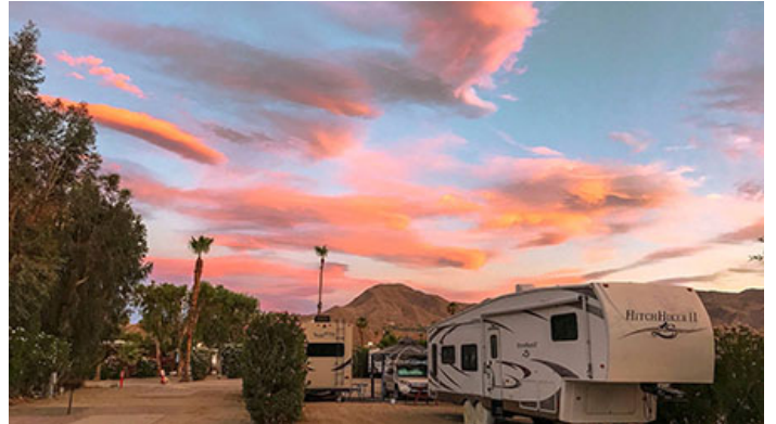
Magnificent sunsets signal the beginning of a beautiful evening

the old, very fragile pedestals that have been a maintenance headache for several years. It's a real step forward in upgrading the utilities on the park.