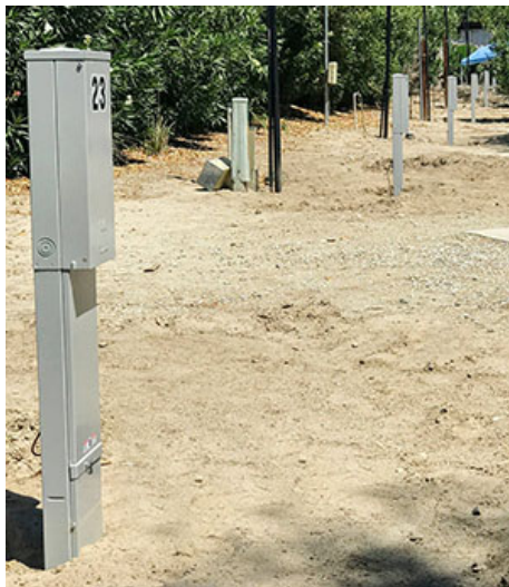
With back row complete, no more old style pedestals in the park!

Even with temperatures exceeding 115° many days, Travis, Mike and Hyde succeeded in completing replacement of all electric