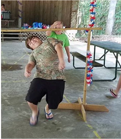
Limbo...how low can you go?

It's hard to believe it's September. Time really does fly when you are having fun and fun is what we have here at Hidden Springs. We celebrated Labor Day Weekend with a lot of activities and even a DJ on Saturday.