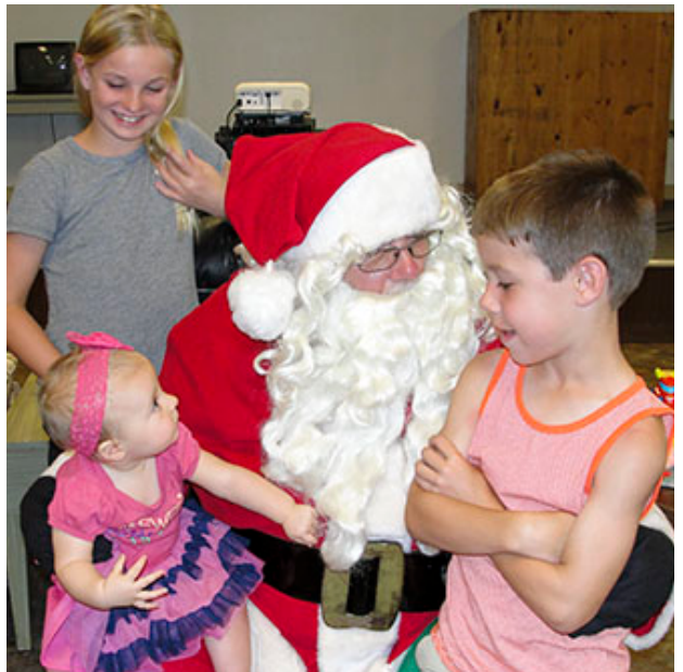
Santa dropped by for an early visit

Hawaiian Luau weekend had the children competing in the hula hoop and limbo contests. They enjoyed the limbo so much they did it again. There was a great deal of laughing and helping going on with the bigger kids instructing and watching out for the smaller ones. That evening we enjoyed the luau as families gathered for a great meal and friendship while we listened to Hawaiian Music.