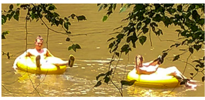
The Welches enjoy a day of tubing

looking forward to celebrating Labor Day Weekend with lots of activities and expect that everyone will have an awesome holiday.