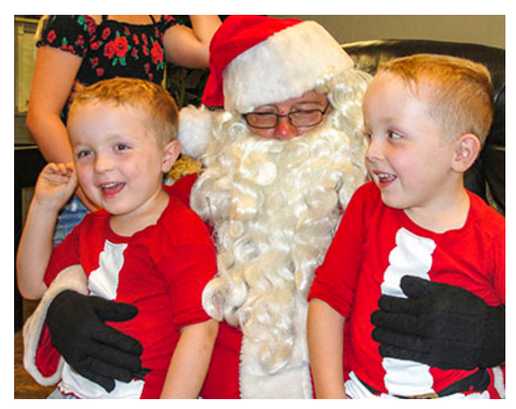
Do twins ask Santa for the same stuff?

The volunteers are working on some upgrades to the back side of the clubhouse and a new play set for the children near the miniature golf course. The play set is needed because we have so many children and not enough swings to go around. The area behind the clubhouse will be a gathering area for adults and family events. We appreciate all the support from our corporate office in these endeavors.