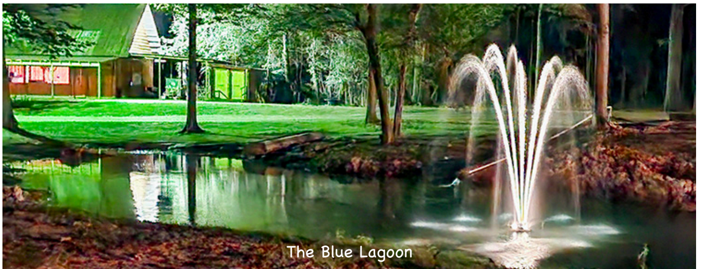
The Blue Lagoon