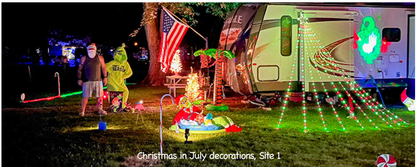
Christmas in July decorations, Site 1