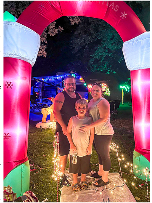
Lambert Family decorations

The anticipation doesn't stop there, as the highly awaited Murder Mystery Weekend approaches. With its intricate plots, engaging