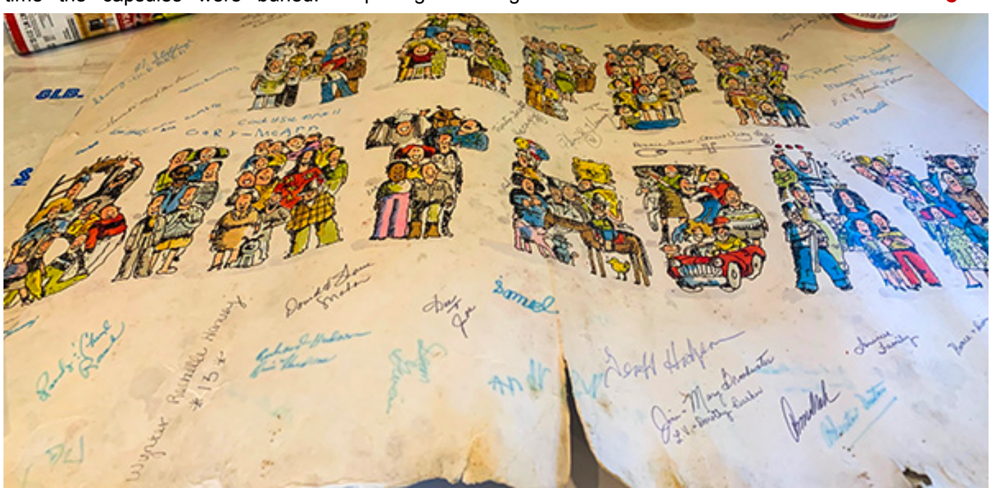
This Happy Birthday card from 1992 was found when we unearthed a Time Capsule