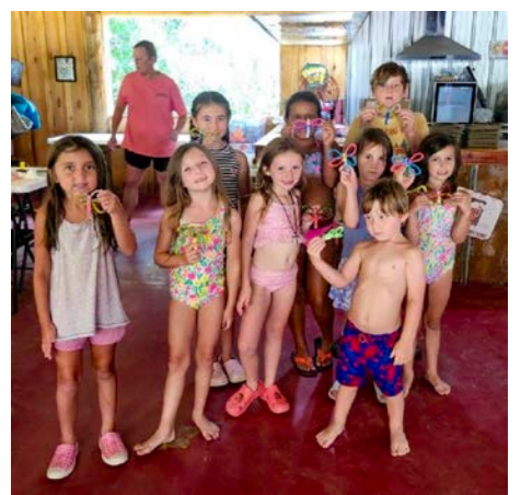
Kids love Arts and Crafts

We had been told by several of our long time members that in 1992 a time capsule had been buried here