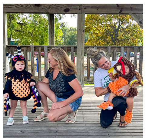
Trick 'r Treaters

As the leaves begin to change and the air turns crisp, let's end the Summer with a Spooktacular good