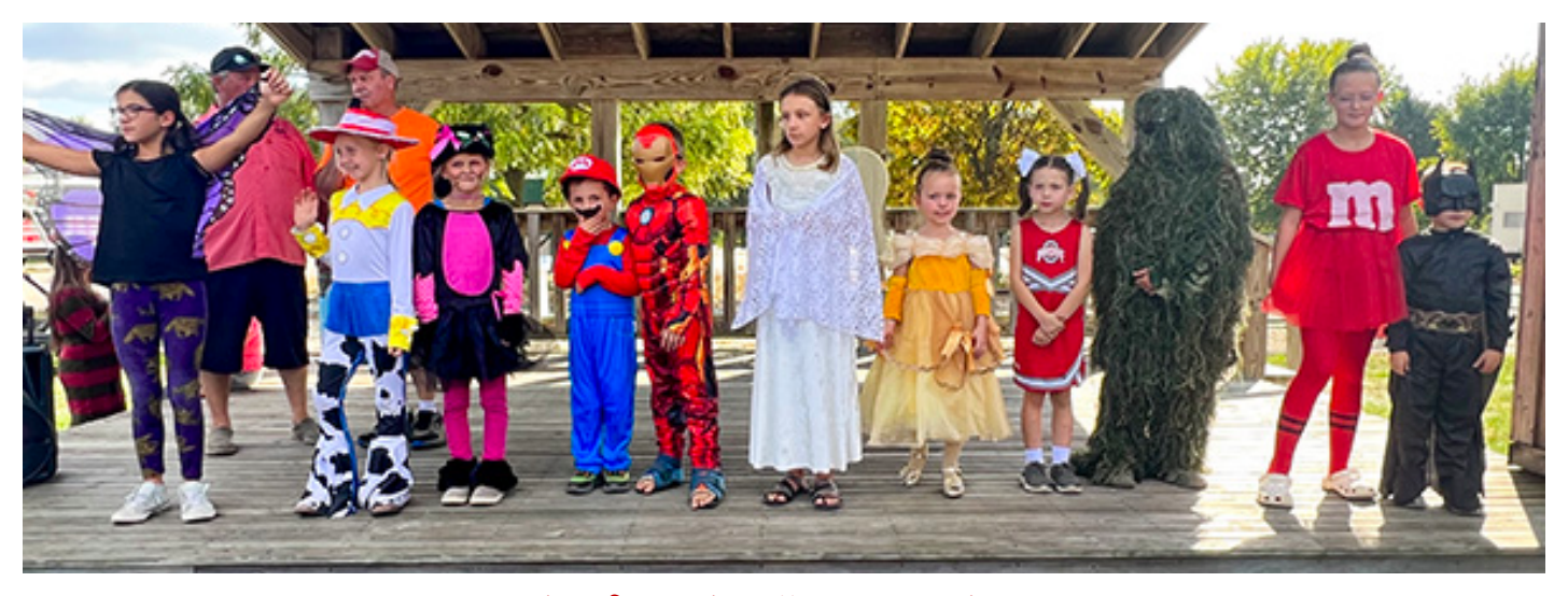
Lots of great Halloween costumes

Additionally, they prepare the firewood we sell at the office. Keeping everyone stocked on firewood for cozy campfires encourages warm gatherings and the making of S'mores. Next time you enjoy a hike or a crackling