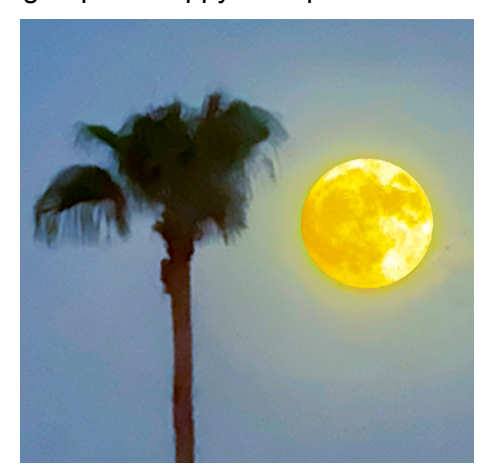
August full moon

But it's different here! Labor Day Weekend is welcomed by our group of Happy Campers as time