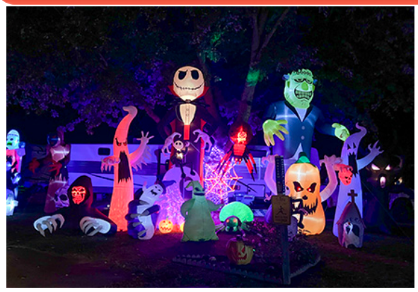
Awesome site decorations!

seekers alike, this event is packed with activities to get you into the Halloween spirit.